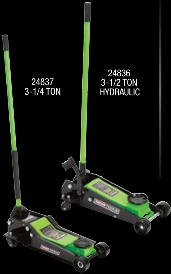
24837 3-1/4 TON