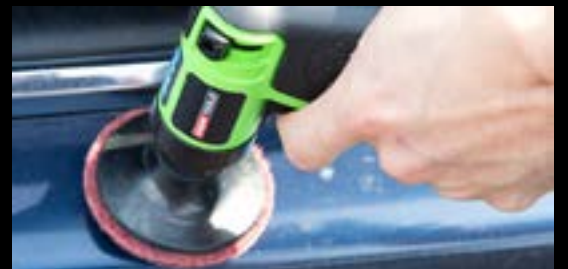
24417 - Heavy Duty Mini Surface Prep Kit