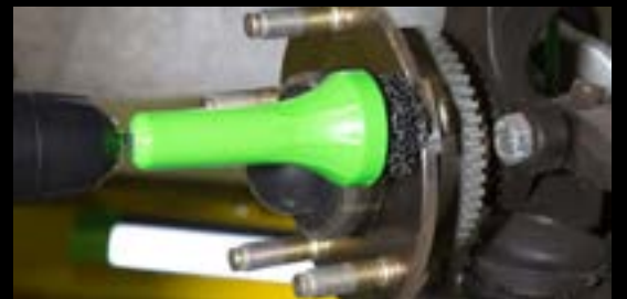
24686 - Brake Hub Resurfacing Tool