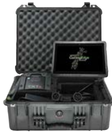
Truck Kit with Rugged Tablet