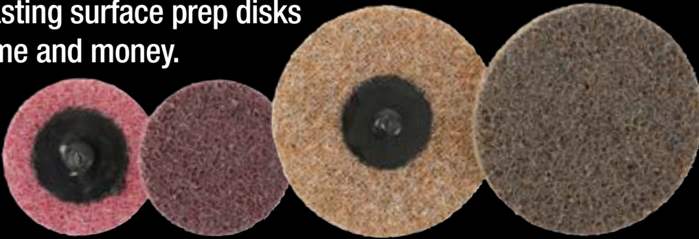
2" and 3" Twist Lock Surface Prep Discs - Medium and Coarse