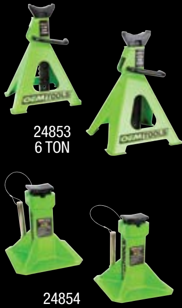
24853 6 TON