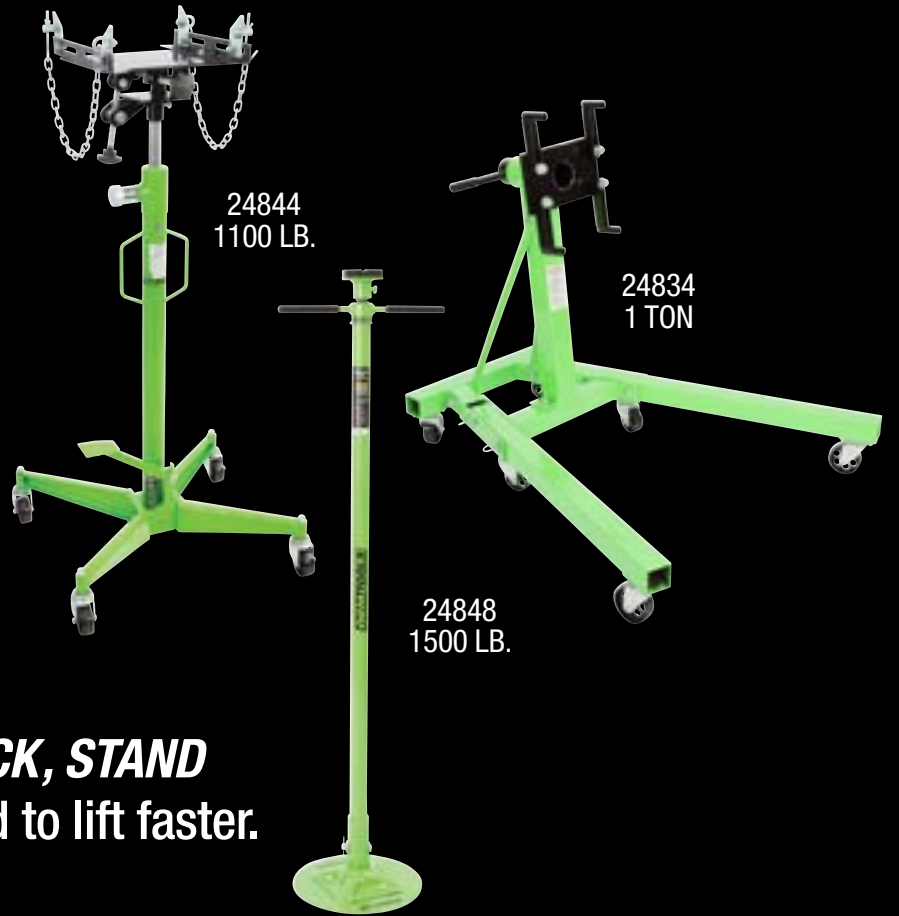
24844 1100 LB.