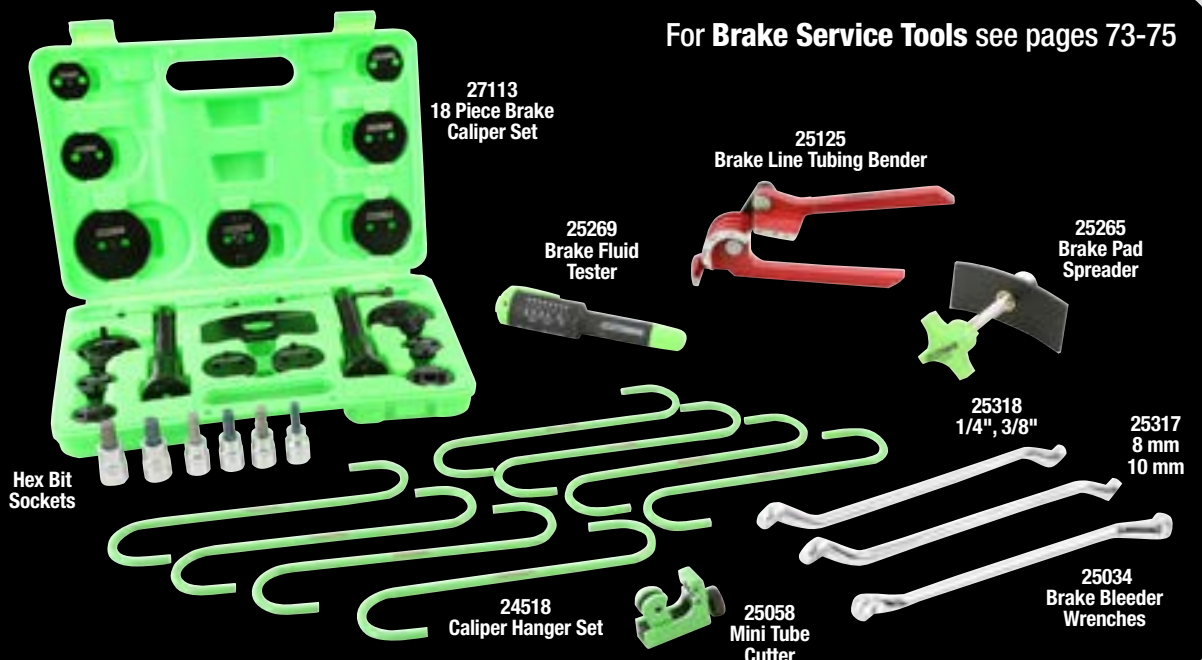
27113 18 Piece Brake Caliper Set