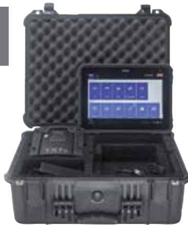
Heavy Duty Truck Kit with Axone Nemo Tablet

Coverage includes: Allison, Caterpillar, Cummins, Detroit-MBE, Haldex, International, Kenworth, PACCAR, Peterbilt, Sterling, UD Trucks (Nissan Diesel), Wabco and more.