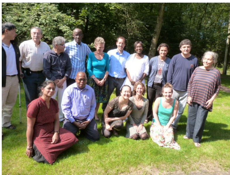
Figure 2 shows the AgriCultures Network in its present shape , with ILEIA as the secretariat, and regional members, each of them connected to their own regional network. All members of the network are connected with the network as a whole, but also bilaterally. Each member also has its own regional network (see example of Brazil): it forms part of multiple networks at different levels (local, regional and global) and this is what makes the global AgriCultures Network vibrant as multiple networks and knowledge systems reinforce one another.

To begin with, the network will build on existing experience and systems. We will continue our practice of having an annual AgriCultures International Meeting (AIM) . This meeting serves as an effective platform to set out strategic directions, review progress, make plans for the coming year, exchange experiences and for building specific capacities of the network members.