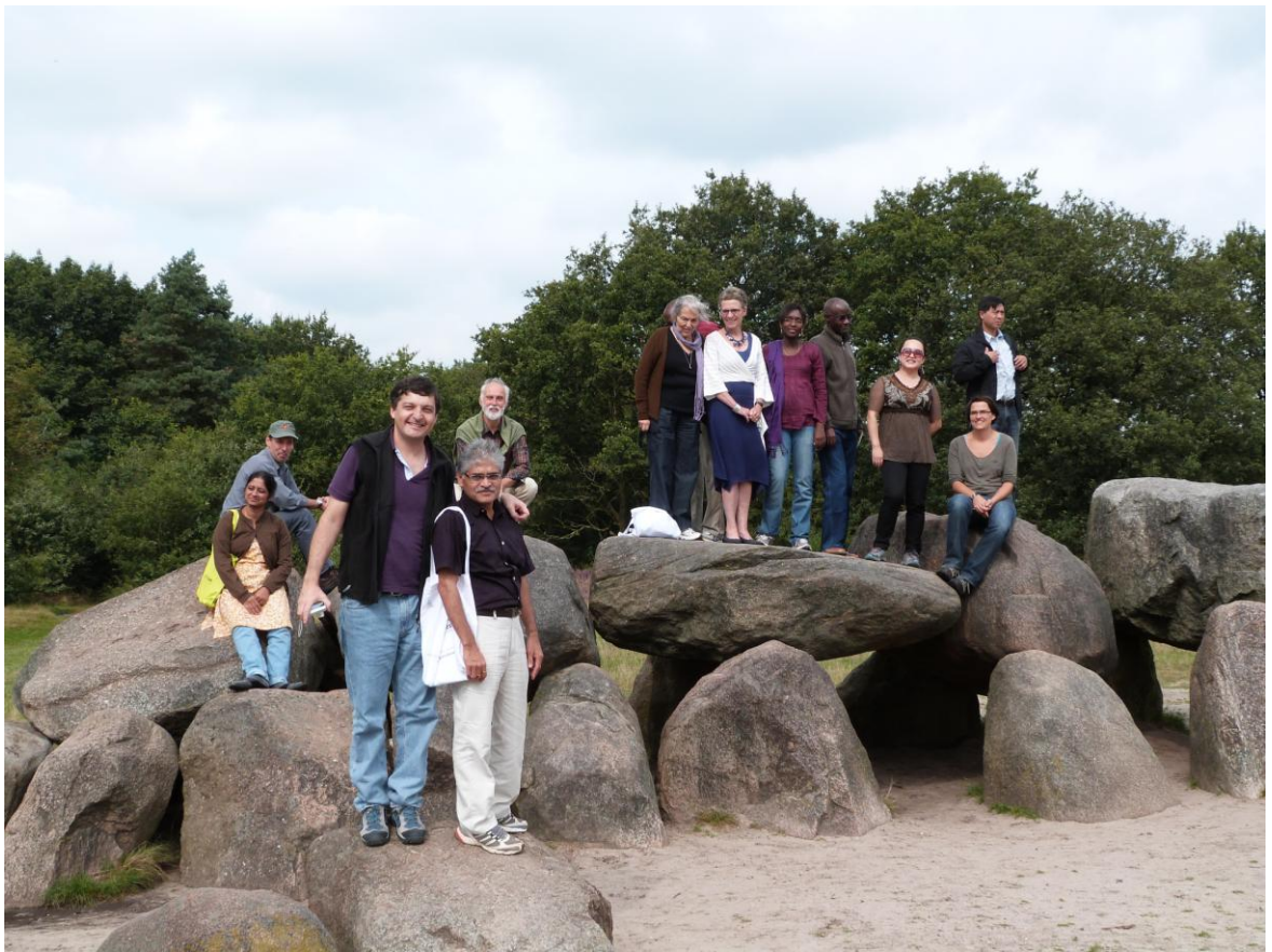
The AgriCultures Network at its 2012 Annual International Meeting