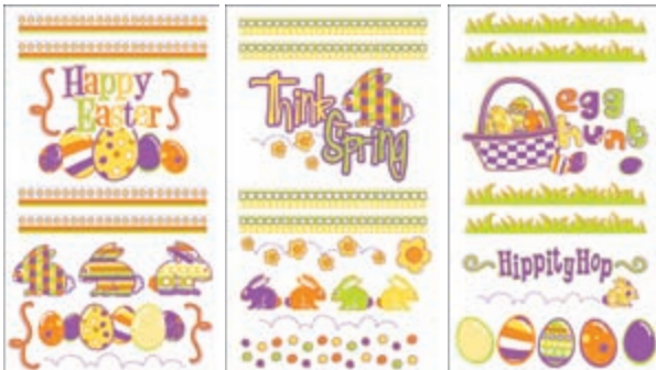
New Happy Easter DIY-TP-EAS $12