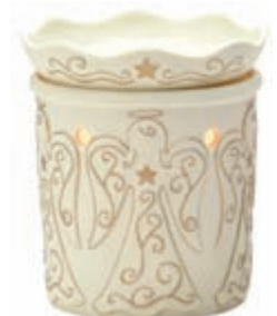
Heavenly DSW-HVEN $36