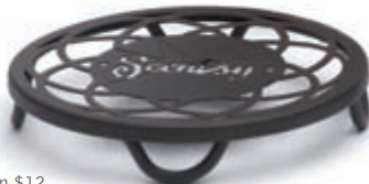
STAND-ROUND 13 cm diameter x 2 cm $12

Elevate your Scentsy warmer to add visual impact to your warmer display. In powder-coated metal with an oil-rubbed bronze finish, Scentsy's new Warmer Stands are available in both square and round designs. $12 each