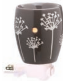
New Taro PSW-TARO $18