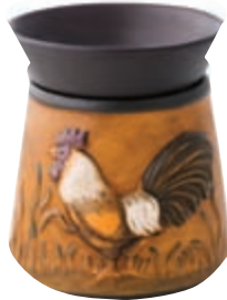
Rooster DSW-RSTR $36