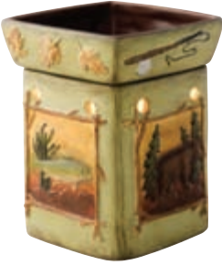
Lodge DSW-LODG $36