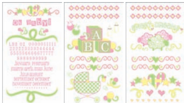
New Baby Girl DIY-TP-BYG $12