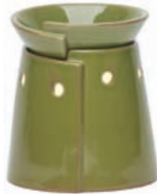
New Greenwich MSW-GRNW $30