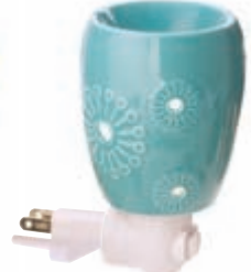
Turquoise PSW-DTUR $18