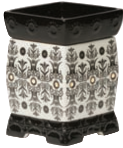
Boleyn DSW-BOLE $36