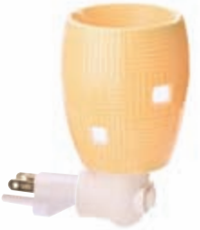
Buttercup PSW-WBUT $18