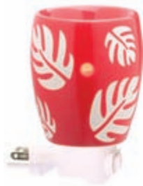
New Luau PSW-LUAU $18