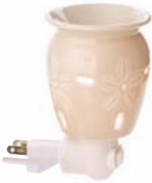
Sand Dollar PSW-SSAN $18