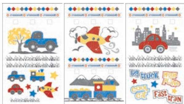
Vroom DIY-TP-VRM $12