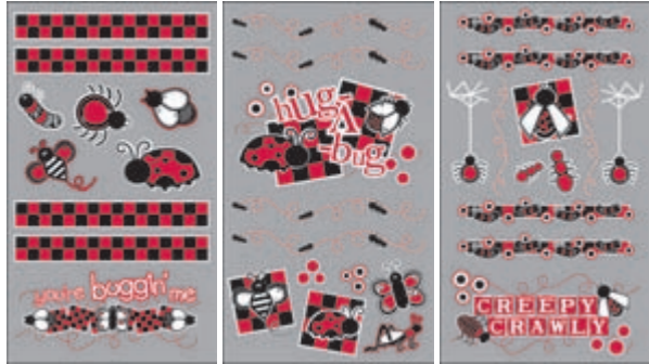
New Creepy Crawly DIY-TP-CCW $12