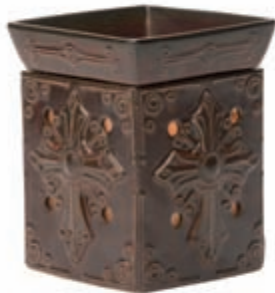
New Faith (R) Glossy Finish DSW-FAIT $36

12 (R) = Reactive Glaze. Final finish may vary.