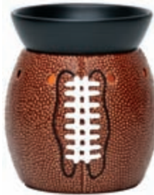
New Game Day DSW-GDAY $36