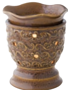
Torino (R) DSW-TORI $36