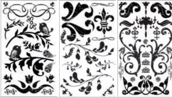
Flourishes DIY-TP-FBK $12