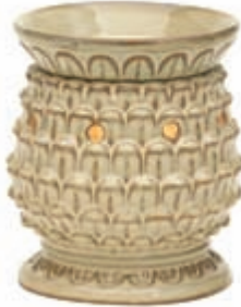
Plantation (R) DSW-PLAN $36