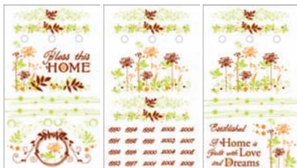
Bless this Home DIY-TP-BTH $12