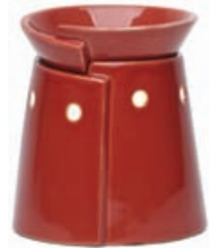
New Tribeca MSW-TRIB $30