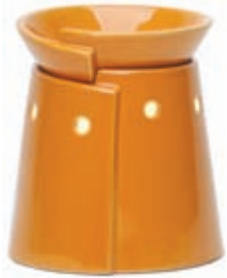
New Soho MSW-SOHO $30