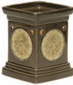
Lotus (R) DSW-LOTU $36