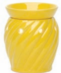
New Canary (R) MSW-CNRY $30