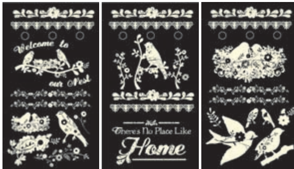
Our Nest DIY-TP-NST $12 Black Warmer Recommended