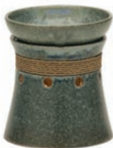
Acadia (R) MSW-ACAD $30