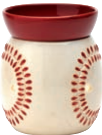
Play Ball DSW-PLAY $36