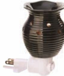
Black PSW-GBLK $18