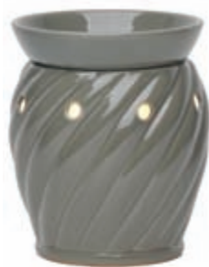
New Sparrow (R) MSW-SPAR $30