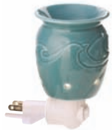
Waves PSW-SWAV $18