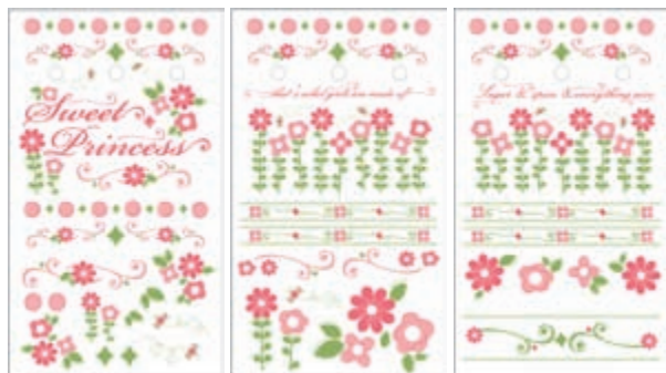
Sweet Princess DIY-TP-SPS $12