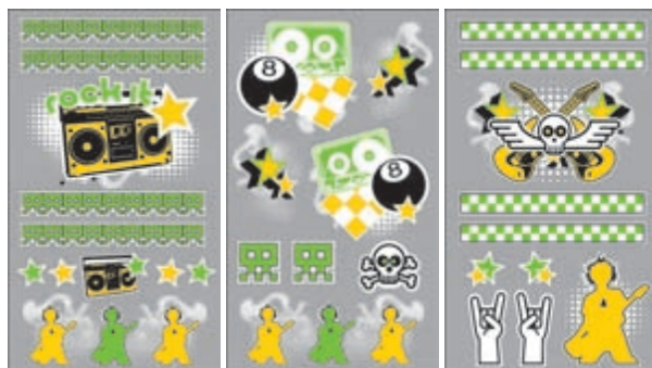
New Rock It DIY-TP-RCK $12