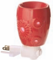
Cherry PSW-DCHE $18