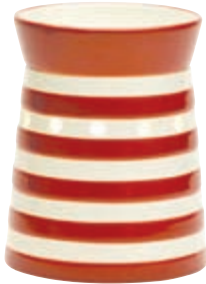
Candy Shoppe DSW-CANY $36