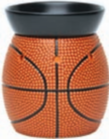
New Full Court DSW-FCRT $36