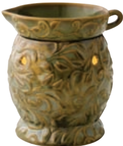
Cyprus (R) DSW-CYPR $36