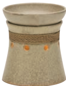
Hatteras (R) MSW-HATT $30