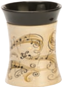
Symphony DSW-SYMP $36