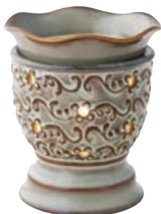
Milano (R) DSW-MILA $36