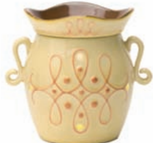
New Nod (R) DSW-NODY $36