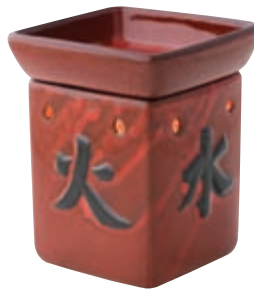
Zensy (R) DSW-ZENS $36