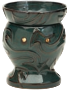
Poseidon (R) DSW-POSE $36