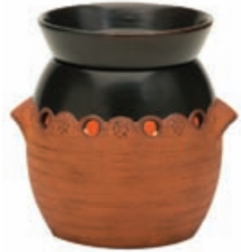
Sonora DSW-SONO $36