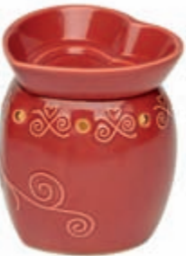
Hugs & Kisses (R) DSW-XOXO $36