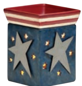
Liberty DSW-LBTY $36