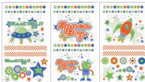
Blast Off DIY-TP-BLO $12