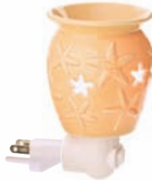
Starfish PSW-SSTA $18