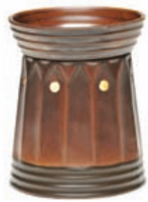
Othello (R) DSW-OTHE $36