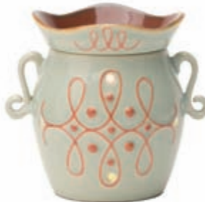
New Blynken (R) DSW-BLNK $36