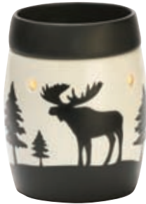
Yukon DSW-YUKO $36