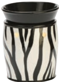
Zebra DSW-ZEBR $36