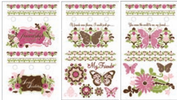
Friendship DIY-TP-FDP $12