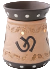
Wild West DSW-WEST $36