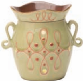
New Wynken (R) DSW-WYNK $36