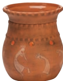
Kokopelli DSW-KOKO $36