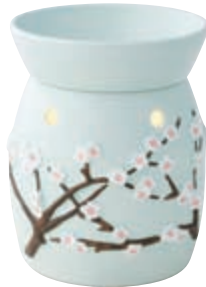
Cherry Blossom DSW-CHER $36