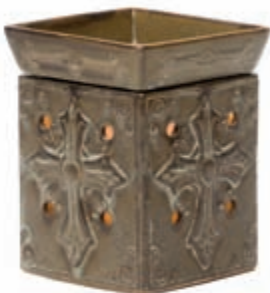
New Hope (R) Matte Finish DSW-HOPE $36