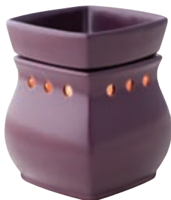
Scentsy Plum DSW-SPLU $36