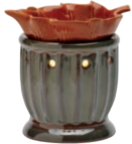
Plymouth* (R) DSW-PLYM $36