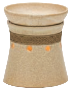
Nantucket (R) MSW-NANT $30