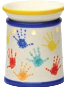
New Sunshine Kids DSW-SFF-KIDS $42