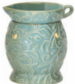
Riviera (R) DSW-RIVI $36