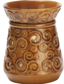
Merino (R) DSW-MERI $36