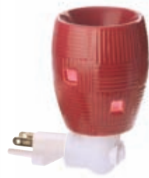
Scarlet PSW-WSCA $18