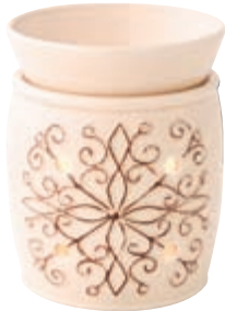
Embellish DSW-EMBE $36