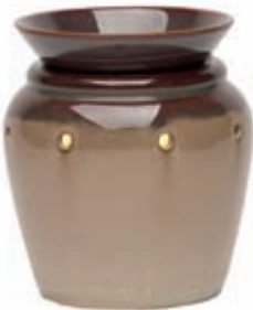
New Riverbed (R) DSW-RBED $36