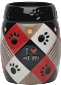
Paws DSW-PAWS $36