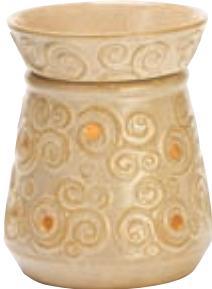
Angora (R) DSW-ANGO $36