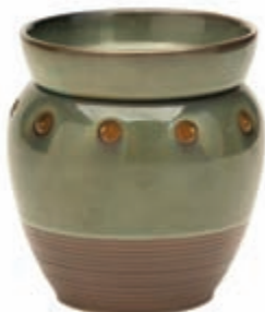
Jadestone (R) MSW-JADE $30