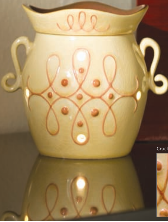
Crackle Finish Detail

Named for three characters in the famous nursery rhyme, "The Dutch Lullaby," Wynken, Blynken, and Nod are whimsical designs with fun and flirty embellishments: a curvaceous dish, fanciful handles, and an embossed curlicue and dot pattern. High-gloss, reactive glaze crackle finishes in soothing pastel tones complete the "fairy tale" look.