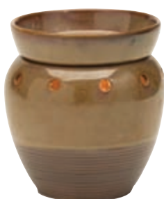
Limestone (R) MSW-LIME $30