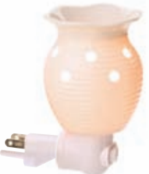
White PSW-GWTE $18