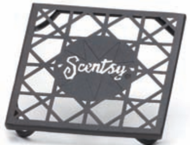
STAND-SQUARE 13 cm x 13 cm x 2 cm $12