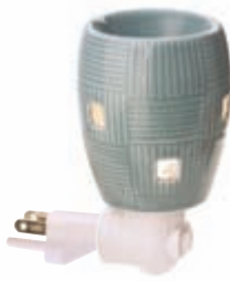
Denim PSW-WDEN $18