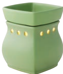
Scentsy Green DSW-SSGR $36