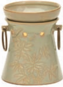
Bamboo Tali (R) DSW-BAMB $36