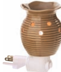
Brown PSW-GBRN $18