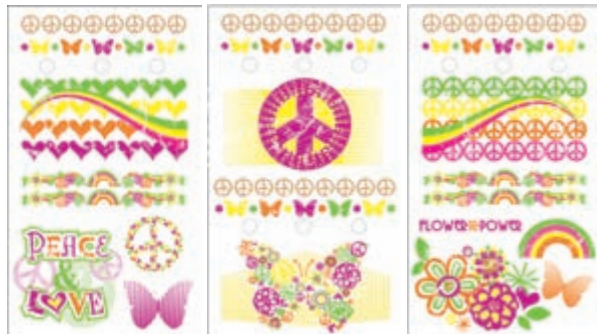
Peace & Love DIY-TP-PLV $12