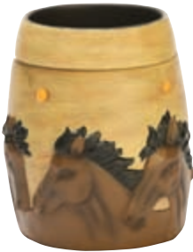
Stampede DSW-STAM $36