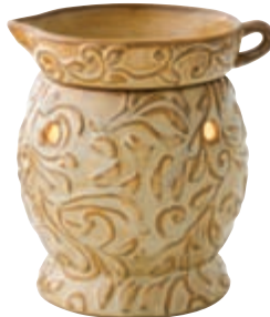
Malta (R) DSW-MALT $36