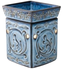
Borneo (R) DSW-BORN $36