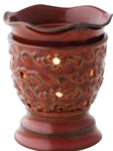
Roma (R) DSW-ROMA $36