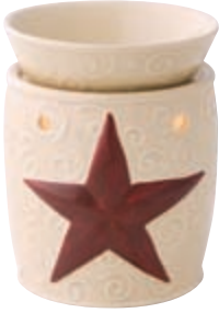
Rustic Star DSW-STAR $36