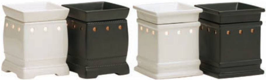
Beaded White DIY-BWTE $36

Scentsy products have never been so much fun! Unleash your creativity with DIY (Design It Yourself) Scentsy Warmers and easy-to-apply rub-on transfer DIY Theme Packs. With 18 theme packs to choose from, you can change the look of your warmer as often as you like.