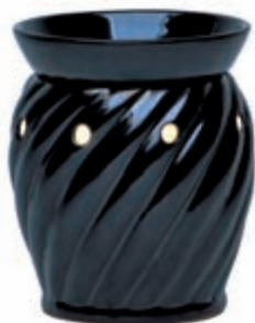
New Raven (R) MSW-RAVN $30

Inspired by the elegantly turned spindles found in antique furniture and woodwork, the Twist Collection juxtaposes traditional elements with bold colour. The high-gloss, reactive glaze finishes highlight the gracefully formed, sinuous curves.