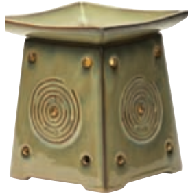
Sendai (R) DSW-SEND $36