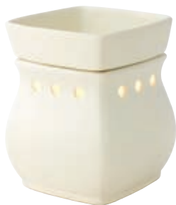
Cream DSW-SCRE $36