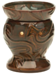
Zeus (R) DSW-ZEUS $36