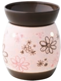
DoodleBud DSW-DBUD $36