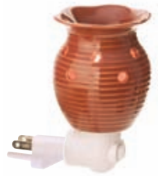
Rust PSW-GRUS $18