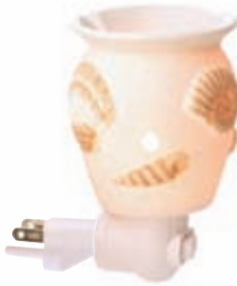
Seashells PSW-SSEA $18