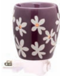
New Lei PSW-LEIP $18

Hip colours and contemporary designs add drama and panache to any space. The fresh, new Botanical Collection provides a vibrant high-gloss pop of colour (in purple, green, red, and gray); when lit, the debossed designs absolutely glow.