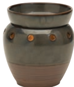
Soapstone (R) MSW-SOAP $30