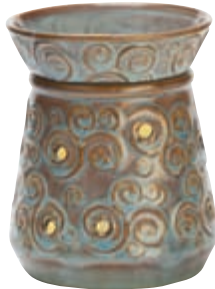
Lisbon (R) DSW-LISB $36