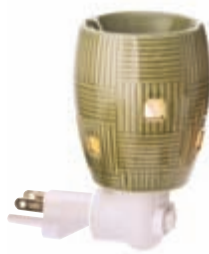
Green PSW-WGRN $18