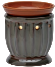
*Optional Dish For Plymouth (R) (Warmer base not included.) TOP-PLY2 $12