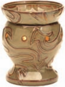
Apollo (R) DSW-APOL $36