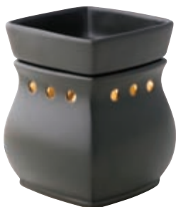
Satin Black DSW-SBLK $36