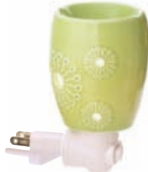
Lime PSW-DLIM $18