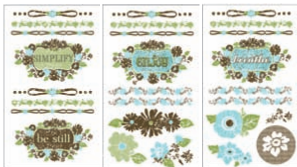
Simplify DIY-TP-SMP $12