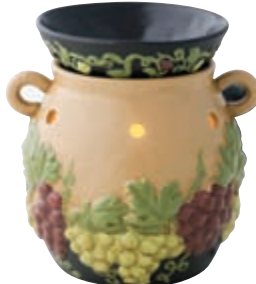
Grapevine DSW-GRAP $36