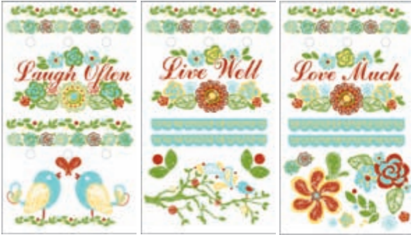
Live. Laugh. Love. DIY-TP-LLL $12