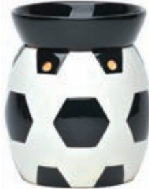
New World Cup DSW-WCUP $36