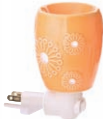
Tangerine PSW-DTAN $18