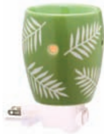
New Grotto PSW-GROT $18