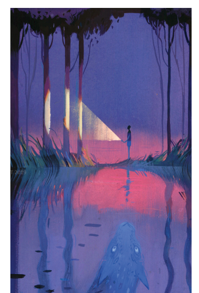
Dean Stuart, Introduction to Illustration.

1:00 – 4:00 pm Beginning $175 / Member $158