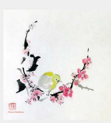
Fumiyo Yoshikawa, Sumi-E / Japanese Brush Painting

Explore the vast range and flexibility of watercolor, add conviction into painting by experimentation. 2 Classes: Fri & Sat, Mar 20 & 21 2:00 – 5:00 pm Intermediate