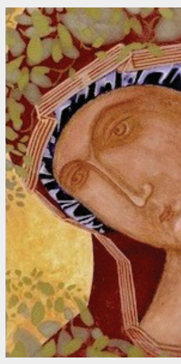
Christopher Castle, Guilding for Artists.

Learn how to apply gold leaf and incorporate gold into art work. Materials fee: $100. 2 Classes: Sun, May 17 & 24 10:00 am - 4:00 pm All Levels, Ages 16+ $160 / Member $144