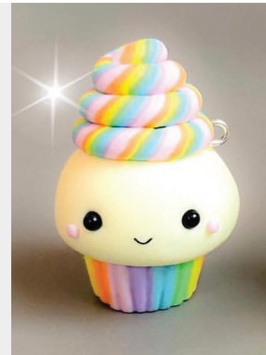
Crystal Bongers, Miniature Clay Creations.