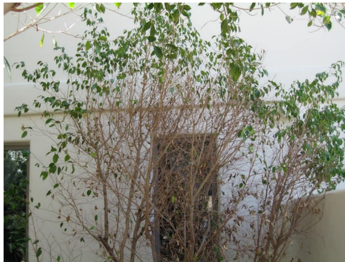
Fig 2. Severely defoliated ficus plant ( Ficus benjamina ).

Severe defoliation in ficus plants (Fig. 2) may prompt the use of chemical sprays. However, the decision to intervene with a pesticide should be carefully considered. In Florida, just one, very well timed soil application of a neonicotinoid insecticide like dinotefuran or imidacloprid provided year-long control of this pest. Mixtures with other insecticides and foliar sprays are generally not necessary and counterproductive because of their negative impacts on beneficial predators and parasites, and the possible development of resistance in the pest to insecticides.