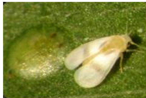
Fig 1. Ficus whitefly adult and mature nymph.

This exotic, invasive pest insect has recently been reported from the Phoenix area in Arizona , causing damage and defoliation in ficus trees. It first arrived in the U.S. in Florida in 2007. Ficus whiteflies are small, winged insects about \frac{1}{8} th inch in length, related to aphids, scale insects and mealy bugs. Nymphs (young ones) are \frac{1}{8} th to \frac{1}{16} th inch in length, flat and oval in shape with red eyes, wingless, and resemble scale insects (Fig. 1). Both adults and nymphs are typically found on the undersides of leaves, but occasionally on the upper sides also. They feed by inserting their needle-like mouthparts into the undersides of leaves and suck out nutrients, resulting in wilting, yellowing, stunting leaf drop and sometimes death of the plant. They are only reported to attack Ficus spp. that are common and popular landscape plants in community environments. They are currently not known to infest other plants.