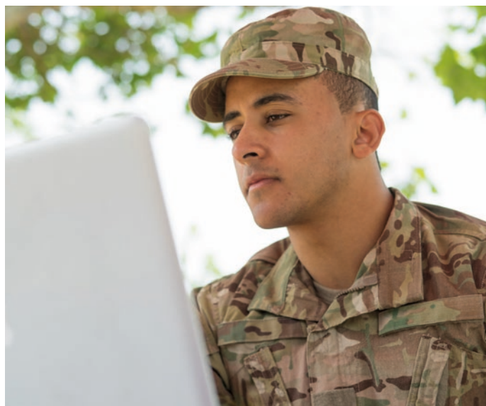
The appearance of U.S. Department of Defense (DoD) visual information does not imply or constitute DoD endorsement.