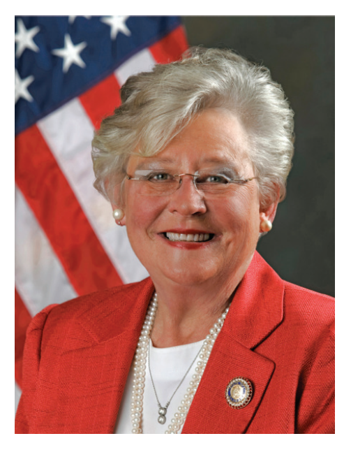
Kay Ivey, Governor of Alabama