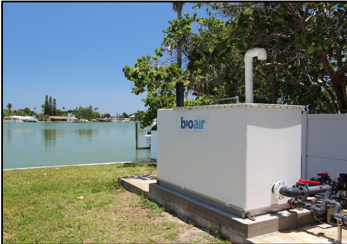
BioAir EcoPure Mini