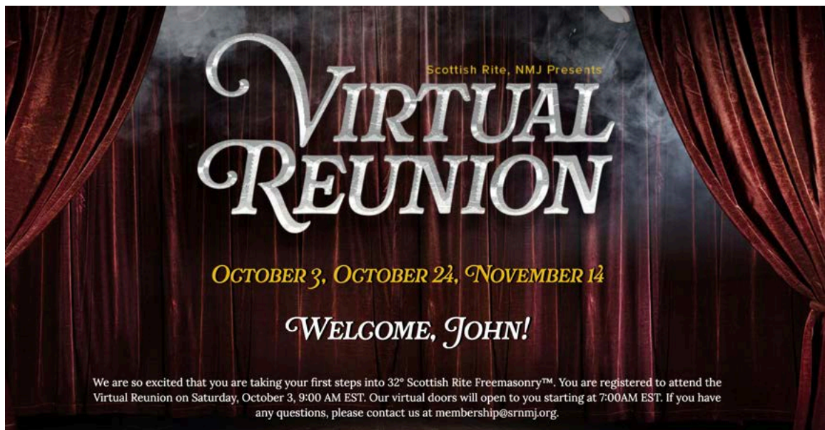
Figure 9: Account logged in to view Virtual Reunions on Reunion.SRNMJ.org (button will be available on day of event)

8) Once they login, they will now be able to access the Virtual Reunion.