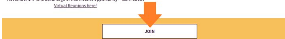
Figure 1: ScottishRiteNMJ.org/Join