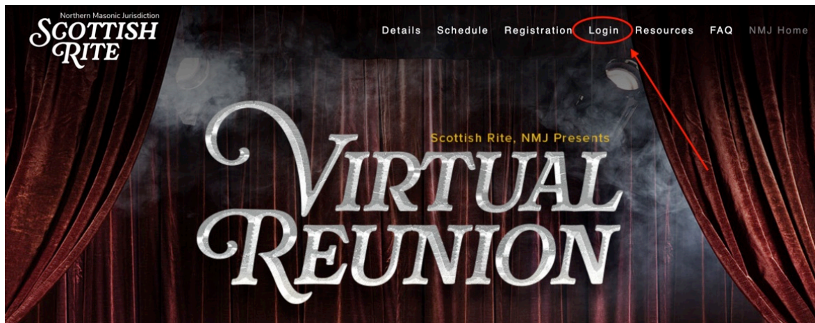
Figure 8: Reunion.SRNMJ.org front page

7) On the day of the Virtual Reunion event, they will login here with their account.