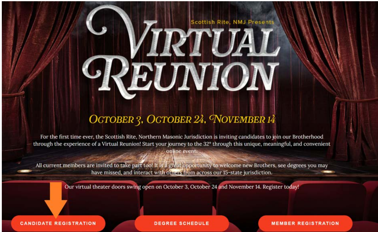
Figure 4: Reunion.SRNMJ.org (front page)

4) When a candidate arrives to the candidate registration form on Reunion.SRNMJ.org , they will use their member number and birthdate to register.