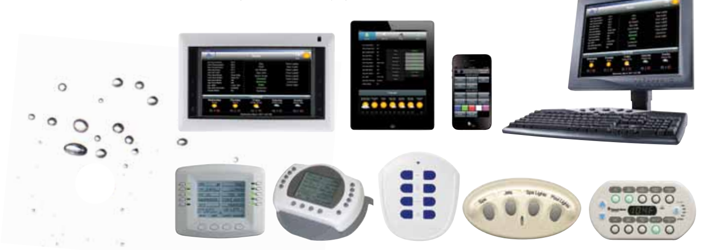
Photos show range of control devices available to interface with IntelliTouch systems—wired, wireless, push-button or touch screen—all are extremely easy to use.

For an overview of all the available ScreenLogic interfaces, see page 10.