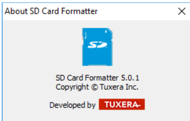
Figure 2: Version information

On Mac OS X/macOS operating systems, click the [SD Card Formatter] menu and then click [About SD Card Formatter].