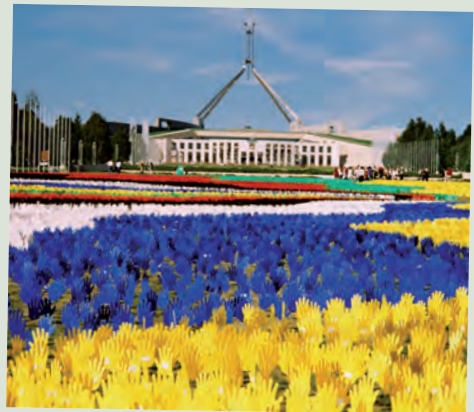
Sea of Hands at Parliament House Canberra. 1997