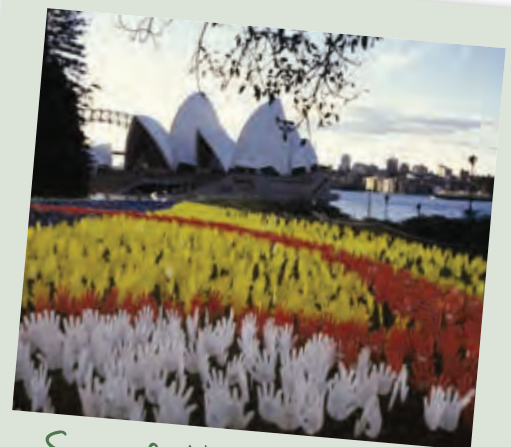
Sea of Hands at the Sydney Botanical Gardens. 1998