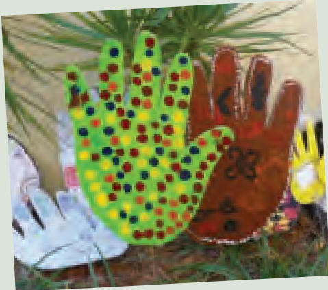
Rainworth State School 2009