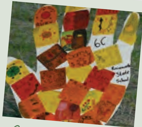
Rainworth State School 2009