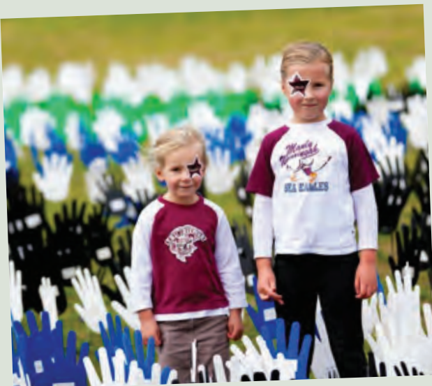
NRL Grand Final 2011 Sea of Hands