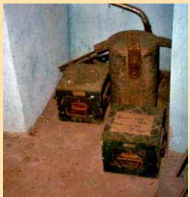
Top left: Exchange container (IAEA). Sealed radioactive sources/M. Al-Mughrabi (IAEA).