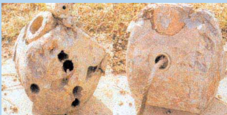
Damaged teletherapy heads.

Investigations found that there were several contributing factors, including inadequate security over the sources and inadequate periodic inventory checks. These were the main factors that allowed the unauthorized sale of the packages to take place. Lack of recognition of the radiation symbol (trefoil) on the source by those trying to dismantle the source was also an important factor. Transfer of the