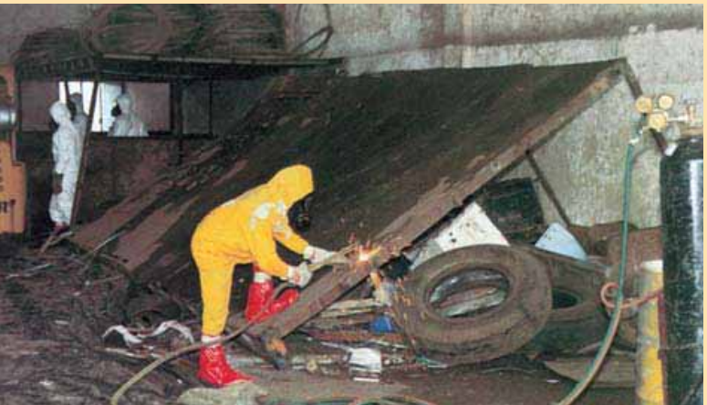
Decontamination work in a scrap yard