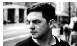
Nico Muhly Composer (USA)