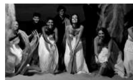
The Australian Voices Choir (AUS)