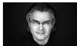
Airat Ichmouratov Composer (CAN/RUS)