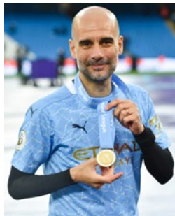
Pep Guardiola won his third Premier League title as Manchester City manager