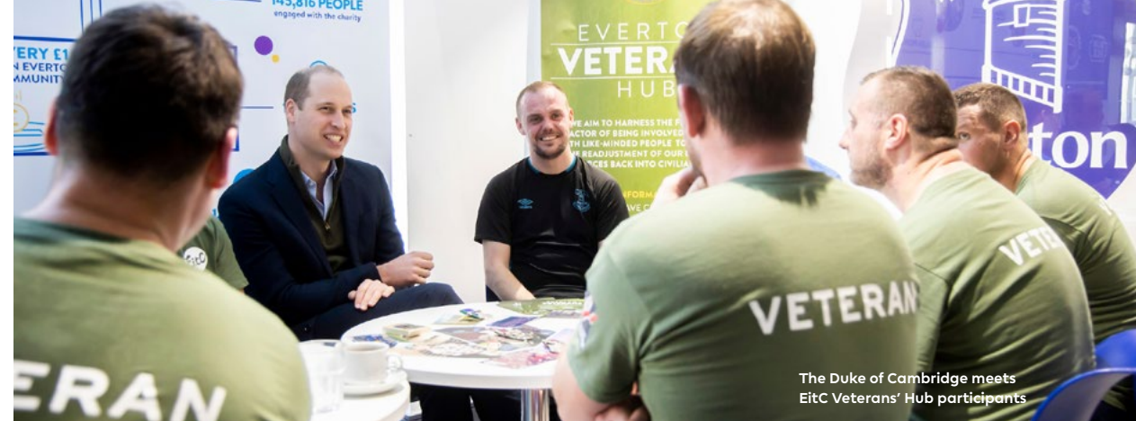
The Duke of Cambridge meets EitC Veterans' Hub participants

"What I really like about the sessions is that you get to communicate with a lot of people and grow bonds," she said. "I was a bit shy at first but once I got into it, it became more fun and there were more things to learn."