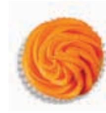
Brilliant Orange Decorating Buttercrème