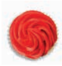
Red Decorating Buttercrème