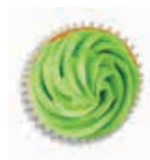
Brilliant Green Decorating Buttercrème