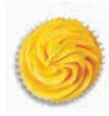
Gold Decorating Buttercrème