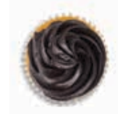
Black Decorating Buttercrème