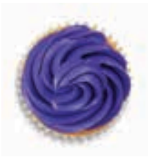
Purple Decorating Buttercrème