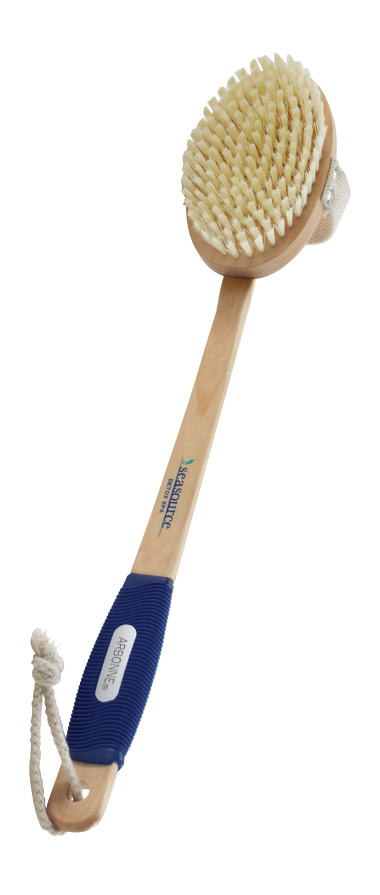
Dry Body Brush

Encouraging Natural Purification and Re-Mineralization