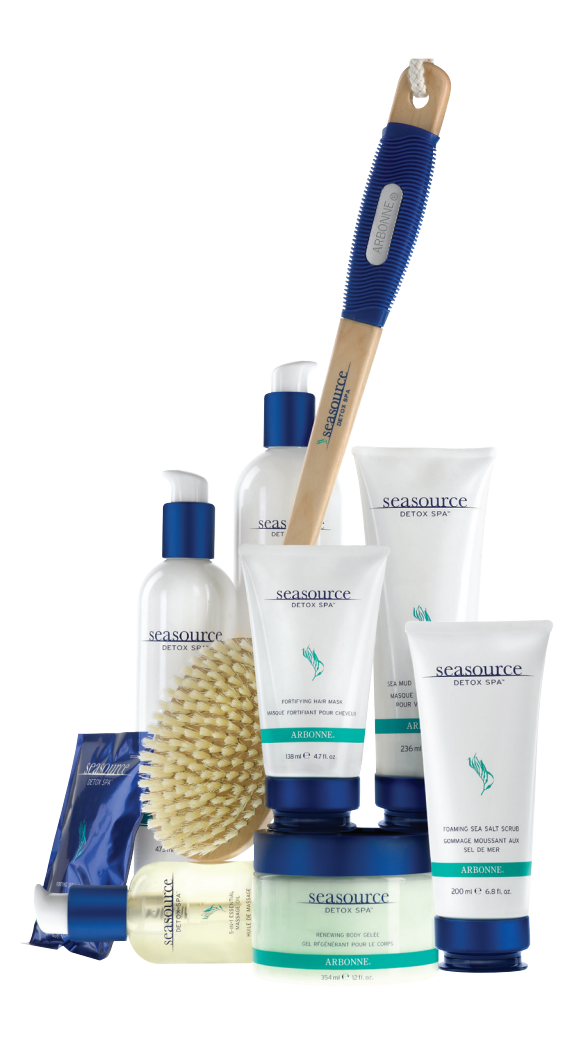
SeaSource Detox \mathrm{Spa}^{\scriptscriptstyle\mathsf{TM}} Set