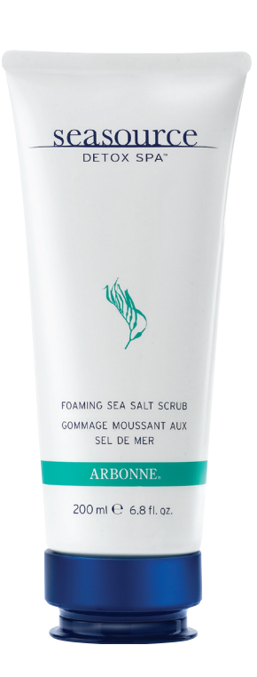
Foaming Sea Salt Scrub