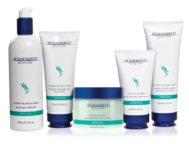
SeaSource Detox Spa Express Set