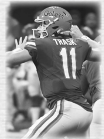
Florida's Kyle Trask threw for 408 yards and three touchdowns.