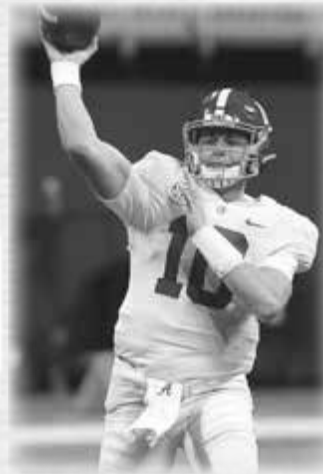
Alabama's Mac Jones passed for an SEC Championship Game record 418 yards.