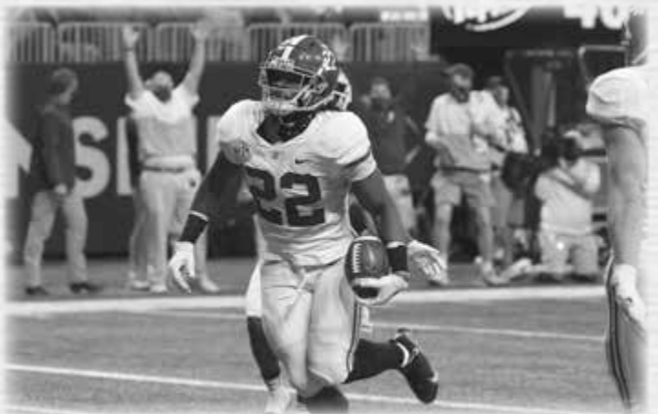
Alabama's Najee Harris set an SEC Championship Game record with five touchdowns (two rushing, three receiving) and earned MVP honors.