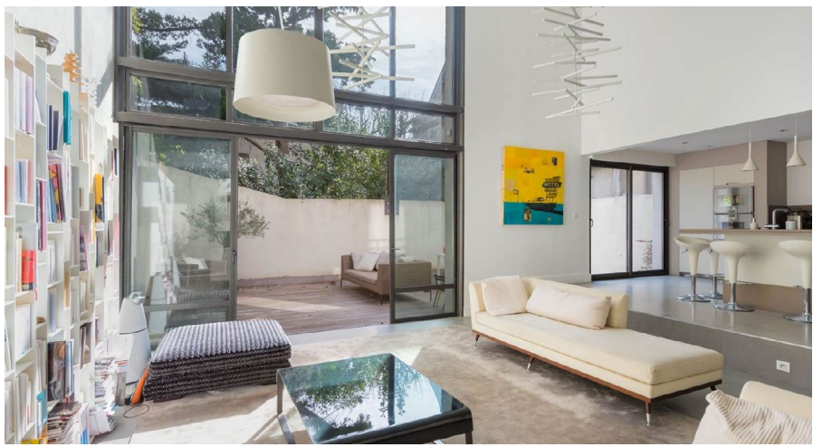
Pron ID: 7F346R