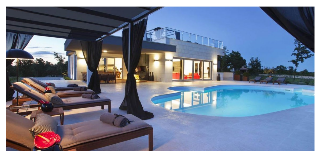
Croatia Sotheby's International Realty | Split Dalmatia, Croatia | 19,275,000 HRK | Prop ID: BDENVN