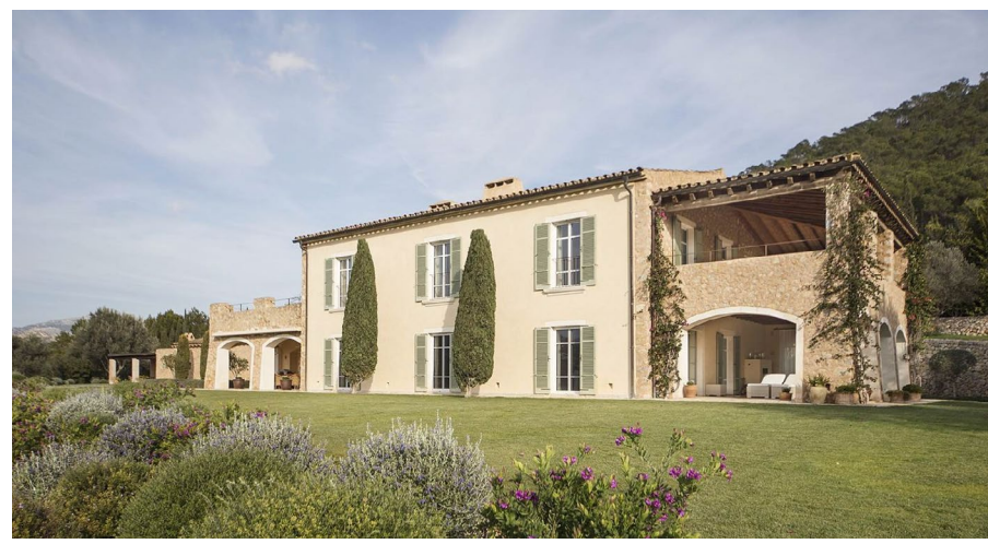
Prop ID: 76RR95