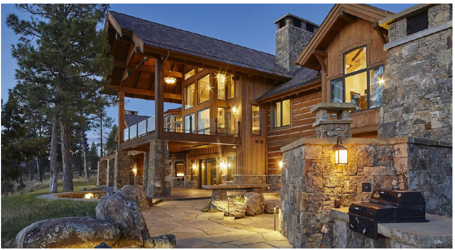
Prop ID: 6Z9Y32