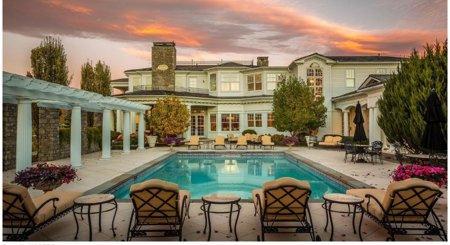
Prop ID: K2885