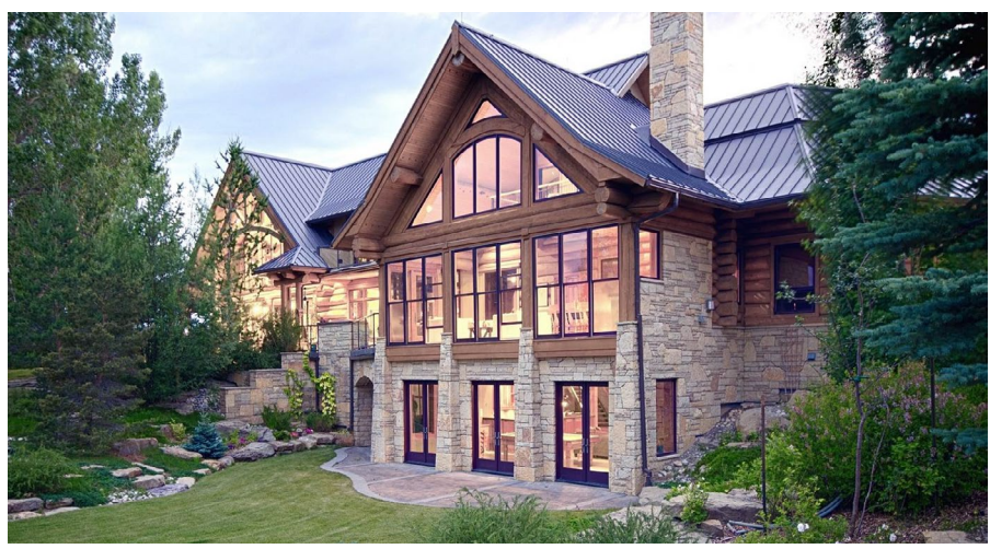
Prop ID: EHFF5K