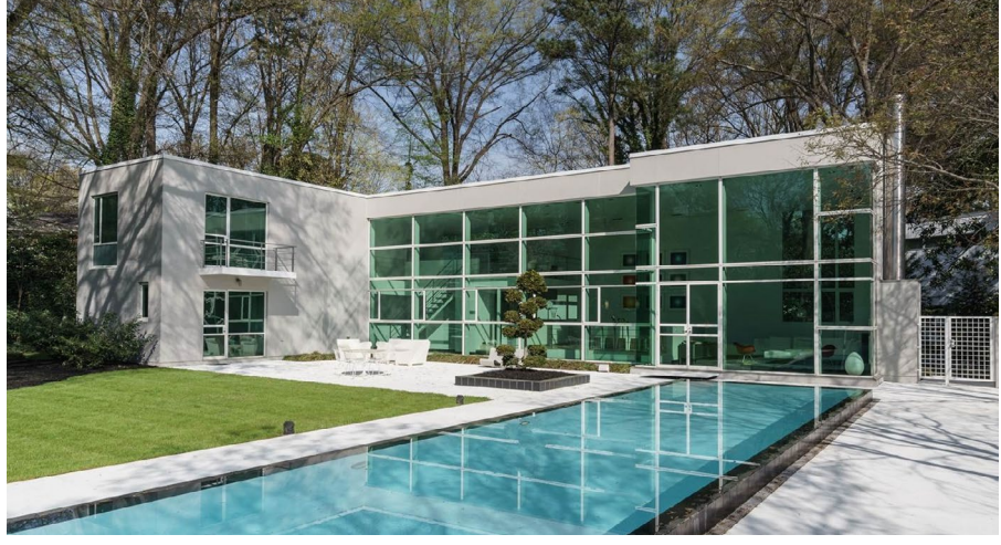
Prop ID: H8V7EE