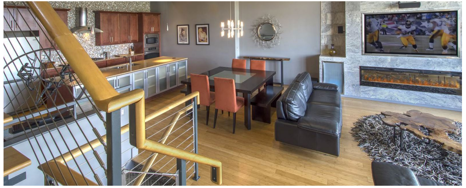
Piatt Sotheby's International Realty | $803,000 | Pittsburgh, Pennsylvania | Prop ID: 926B6X

You'll also find gorgeous, renovated Victorians sprinkled throughout Pittsburgh's 90 neighborhoods." Plentiful in nature's amenities,