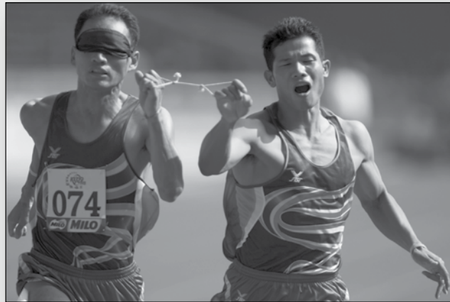
A blind runner and his guide approach the finish line during a paralympic event in Malaysia.

Study the image and caption below. Think about the message being conveyed.