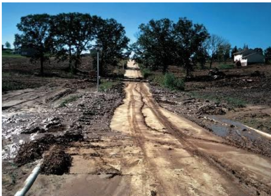
Figure 7D-1.01: Sediment in Street Due to Inadequate Erosion and Sediment Control During Construction

Sediment control practices are generally more expensive and less effective than providing proper erosion control. While sediment control structures can remove significant amounts of sediment from stormwater runoff, and should be implemented as part of the overall erosion and sediment control plan, they should be considered secondary to erosion control for the reasons described above.