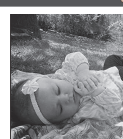
Posted by: amberstarr82