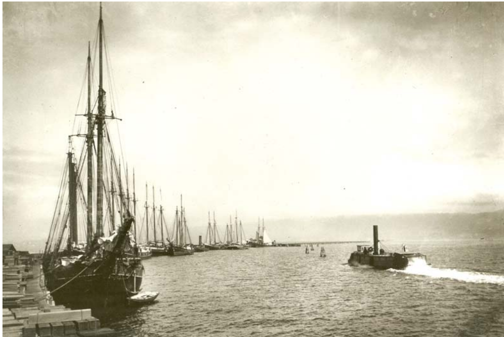
Figure 77. Schooners lined up to take on lumber, probably in Arcata.