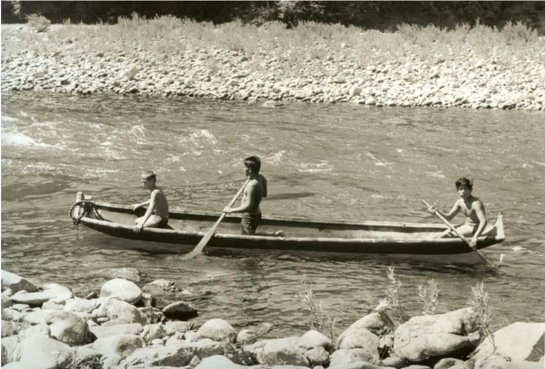
Figure 69. Replica of a Yurok dugout canoe.