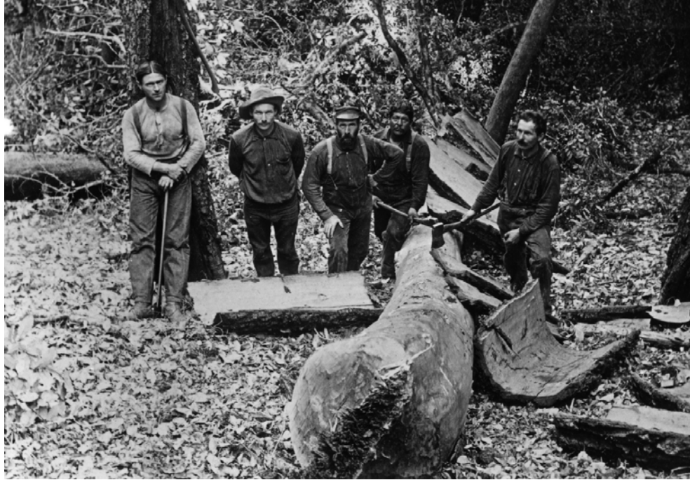
Figure 74. Tanoak bark was used in the tanning of hides to make leather.

When Mexico won independence from Spain in 1821, pastureland was the major concern. Redwood continued to be used in relatively small quantities, but the Mexicans were more interested in tallow and hides than in timber.