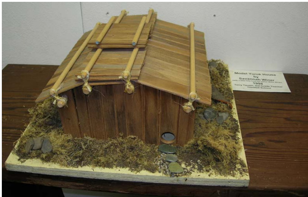
Figure 72. Model of a Yurok plank house on display at Patrick's Point State Park.