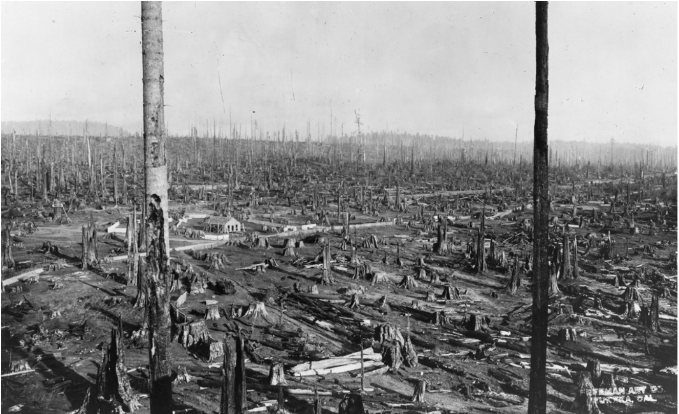
Figure 75. Logged forest near Trinidad (north of Arcata), 1919. It appears that slash and underbrush have been cleared by burning. Note the building to the left of center. This same photograph appears in The Redwood Forester , Volume II, Number One, published circa 1933. It is accompanied by a photograph of the same area taken fourteen years later (1933?) showing how "natural second growth made farming almost impossible." ( The Redwood Forester , 1933?)

Logging of the redwoods in Mendocino County began in the 1850s, and several towns such as Fort Bragg, Mendocino, and Albion developed around the industry. Since that portion of the coast has no sizeable harbors, the logs were shipped to the San Francisco Bay area on small lumber schooners. Intricate systems of cables and chutes were used to transfer the wood from the shore to the ships. (Figure 76.)