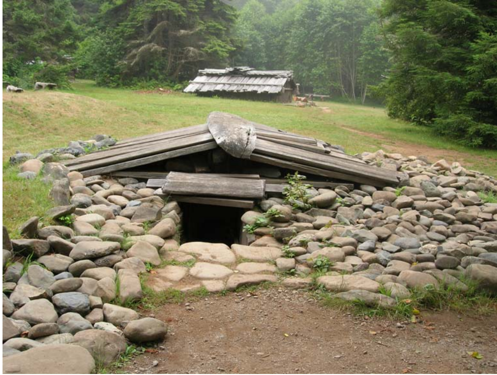
Figure 71. Replica of a Yurok sweat house at Patrick's Point State Park.