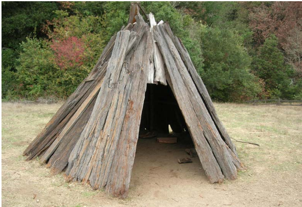
Figure 73. Redwood bark houses, or kotchas, were made by the Coastal Miwok. This replica is part of the Kule Loklo replica Coastal Miwok village at Point Reyes National Seashore.

It was the Kashaya who were encountered by the Russians when they established the Fort Ross settlement in 1811-1812.