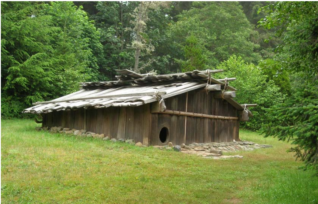
Figure 70. This replica of a Yurok redwood plank house can be seen at Patrick's Point State Park, north of Arcata. Note the small entrance opening, which helps conserve heat and makes the dwelling more secure. Since the house surrounds a pit, the walls needn't be very tall.