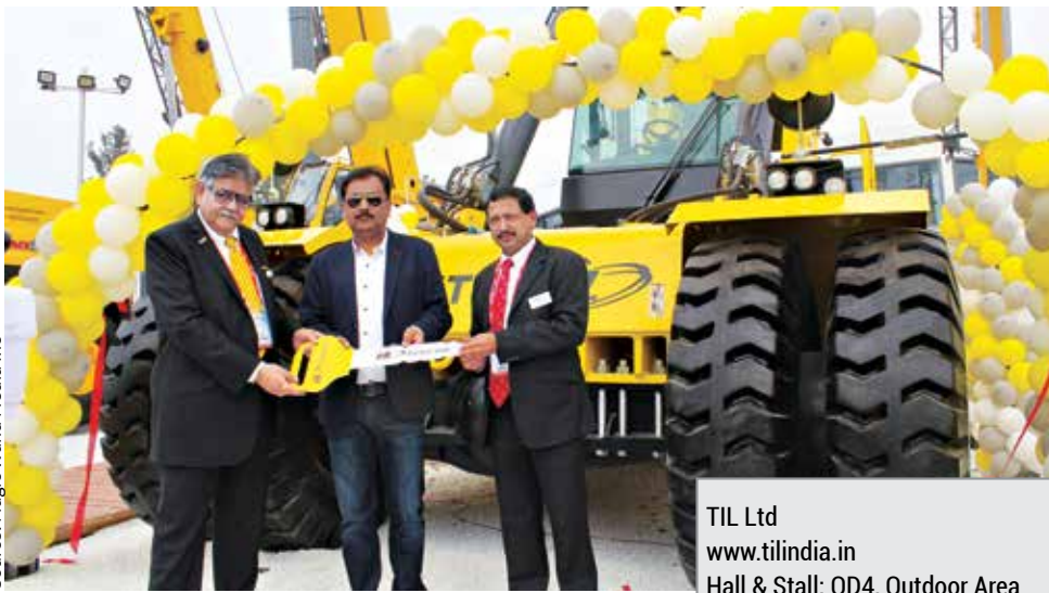
TIL Ltd www.tilindia.in Hall & Stall: OD4, Outdoor Area