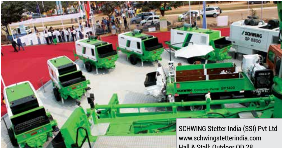
SCHWING Stetter India (SSI) Pvt Ltd www.schwingstetterindia.com Hall & Stall: Outdoor OD 28