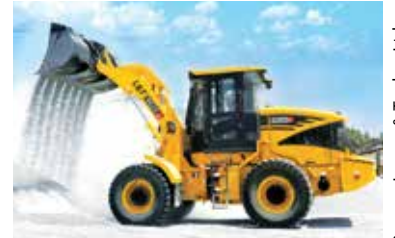
L&T 9020sx - designed and developed by in house R&D

Komatsu has showcased its entire range of construction segment machines at the exhibition, namely, Komatsu Hydraulic Excavators models PC71, PC130, PC210, PC300, PC450 and D85 Crawler Dozer. The highlight is the first-time display of Komatsu GD535 Motor Grader with world-class features such as Komtrax machine tracking system, and PC350 Hydraulic Excavator with reinforced structures. These machines carry the hallmark of cutting-edge Japanese technology and have been very well accepted in the Indian market. PC210 Super Long Front machine is also on display along with PC71 Tunnel and PC130 Quarry variants. L&T extends complete after-sales service solutions to the wide range of Komatsu excavators for various segments and applications. L&T has put up an impressive display of its entire range of road machinery such as L&T 1190 Soil Compactor, L&T 990 Tandem Compactor, L&T 491 Mini Compactor and L&T 9020sx Wheel Loader. L&T 2490 Pneumatic Tyred Handler, L&T S315R Skid Steer Loader and L&T 5590H Hydraulic Paver will be laun-