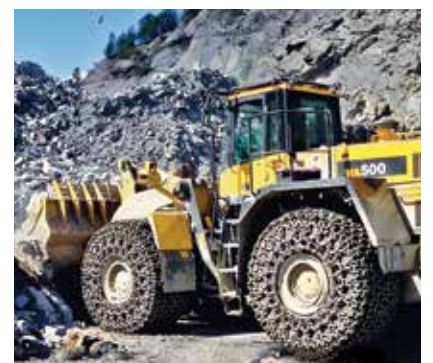
Tyre Protection Chains from Las-Zirh of Turkey

It seems to be an undersold product especially where the market for Tyres is so mature and developed. In most advanced countries, Las-Zirh Chains are very commonly