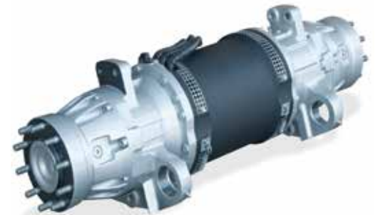
Bonfiglioli's 600F axle for electrically operated vehicles.

"Our business philosophy has been to partner with OEMs who are leaders in their business and develop highly customized power transmission solutions to cater to their requirements," he informs. This must be one of the many reasons for Bonfiglioli to be the largest producer of planetary drives for mobile equipment. The company has extended the same approach to the Indian market as well, with the target audience being major OEMs operating in India.