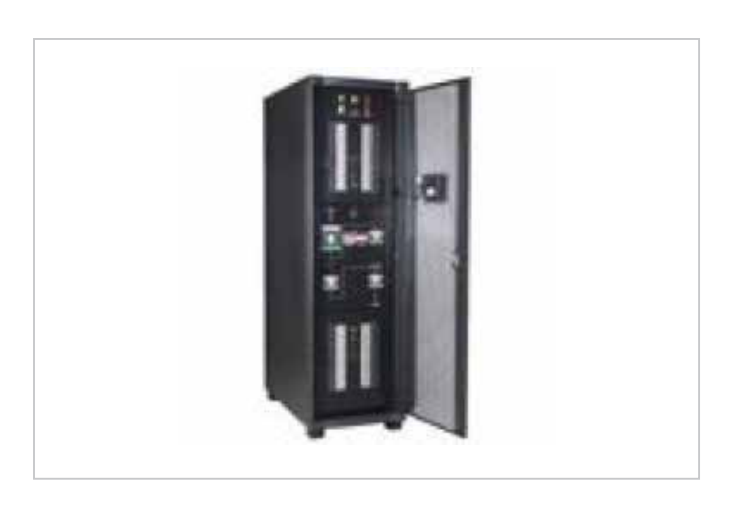
product name: Intelligent power distribution cabinet (IPDC)