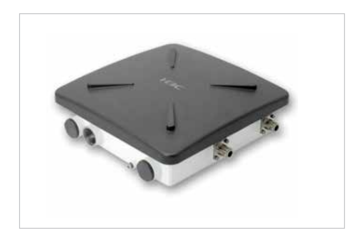
product name: H3C WA2600 X series