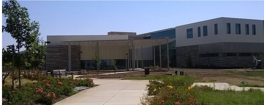
Join us October 13th at 10 a.m. for the grand opening of the Betty Irene Moore Hall and the Retiree Center's Sacramento office.