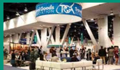
Watch your fingers...you’ve entered the TGA coffee lounge and warm cookie feeding-frenzy. Retailers and exhibitors get their caffeine and blood-sugar levels up – and catch up on gossip – after a long morning of meetings.