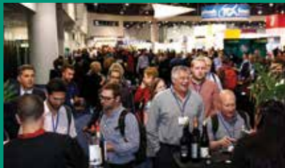
Retailers and exhibitors celebrate the successful close of the first day of The Show with a refreshing beverage at the Opening Night Party.