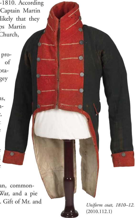
Uniform coat, 1810–12. (2010.112.1)