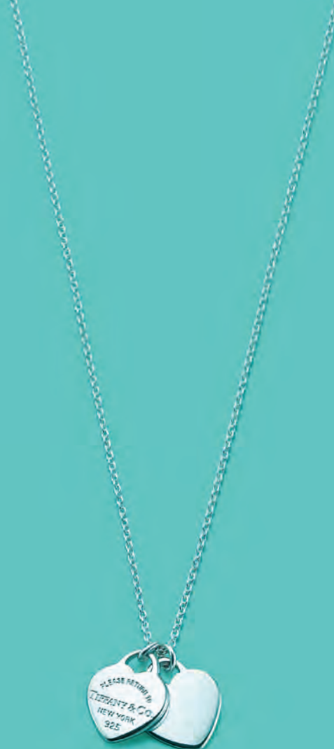
G. Return to Tiffany™ double heart tag pendant in sterling silver, mini.