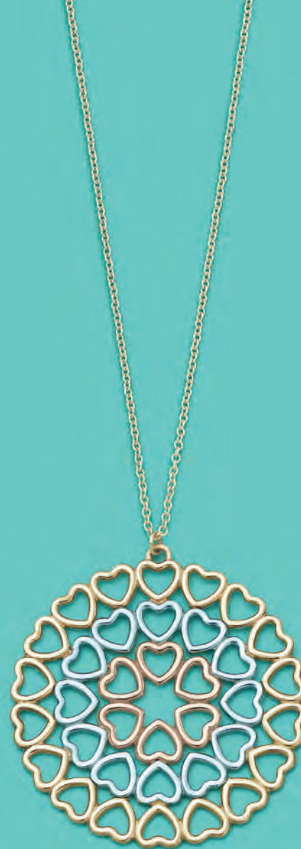
G. Paloma's Crown of Hearts open medallion pendant in 18k yellow, white and rose gold. Original designs copyrighted by Paloma Picasso.