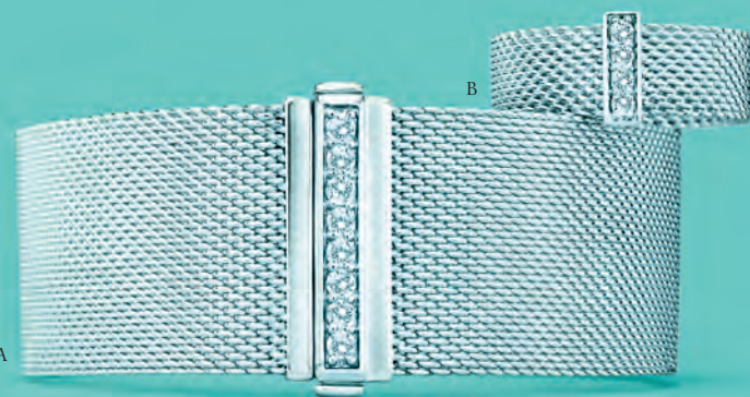
Tiffany Somerset™ in sterling silver with diamonds. A. Bracelet. B. Ring