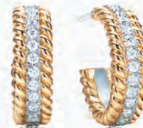
H. Jean Schlumberger Rope two-row hoop earrings in 18k gold and platinum with diamonds, extra small, for pierced ears.