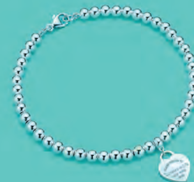
G. Return to Tiffany™ mini heart tag on a bead bracelet in sterling silver, 4 mm beads.