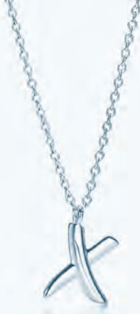
E. Paloma's X pendant in sterling silver, small. Also in 18k gold.