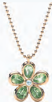
F. Tiffany Garden flower pendant in 18k gold with peridots and a diamond, small.