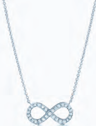
B. Tiffany Infinity pendant in platinum with diamonds.