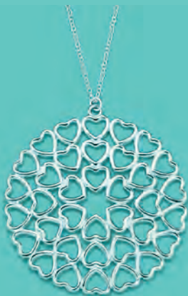
D. Paloma's Crown of Hearts open medallion pendant in sterling silver.