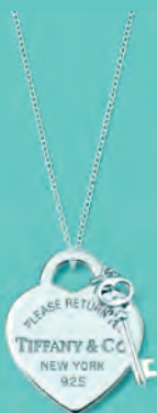
F. Return to Tiffany™ heart tag key pendant in sterling silver, medium.