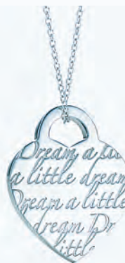
G. Tiffany Notes “Dream A Little Dream” heart tag pendant in sterling silver.