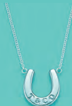
G. T&CO.® horseshoe pendant in sterling silver.