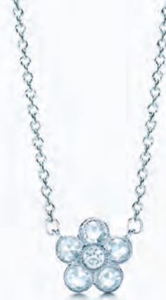
F. Tiffany Garden flower pendant in platinum with diamonds, mini.

Tiffany Celebration rings in platinum with diamonds. A. Tiffany Bezel. B. Shared setting with pink sapphires. C. Victoria alternating. D. Etoile three-row with pavé diamonds. E. Tiffany Legacy with pink sapphires.