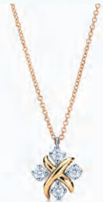
G. Jean Schlumberger Lynn pendant in 18k gold and platinum with diamonds. Also in platinum.