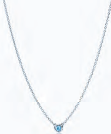
B. Elsa Peretti® Color by the Yard necklace in sterling silver with an aquamarine.