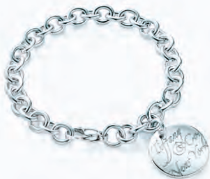
D. Tiffany Notes “Tiffany & Co.” small round tag bracelet in sterling silver.