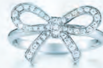
H. Bow ring in platinum with diamonds.