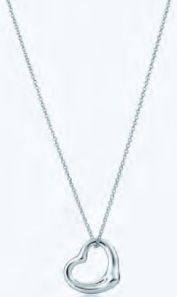
A. Elsa Peretti® Open Heart pendant in sterling silver.