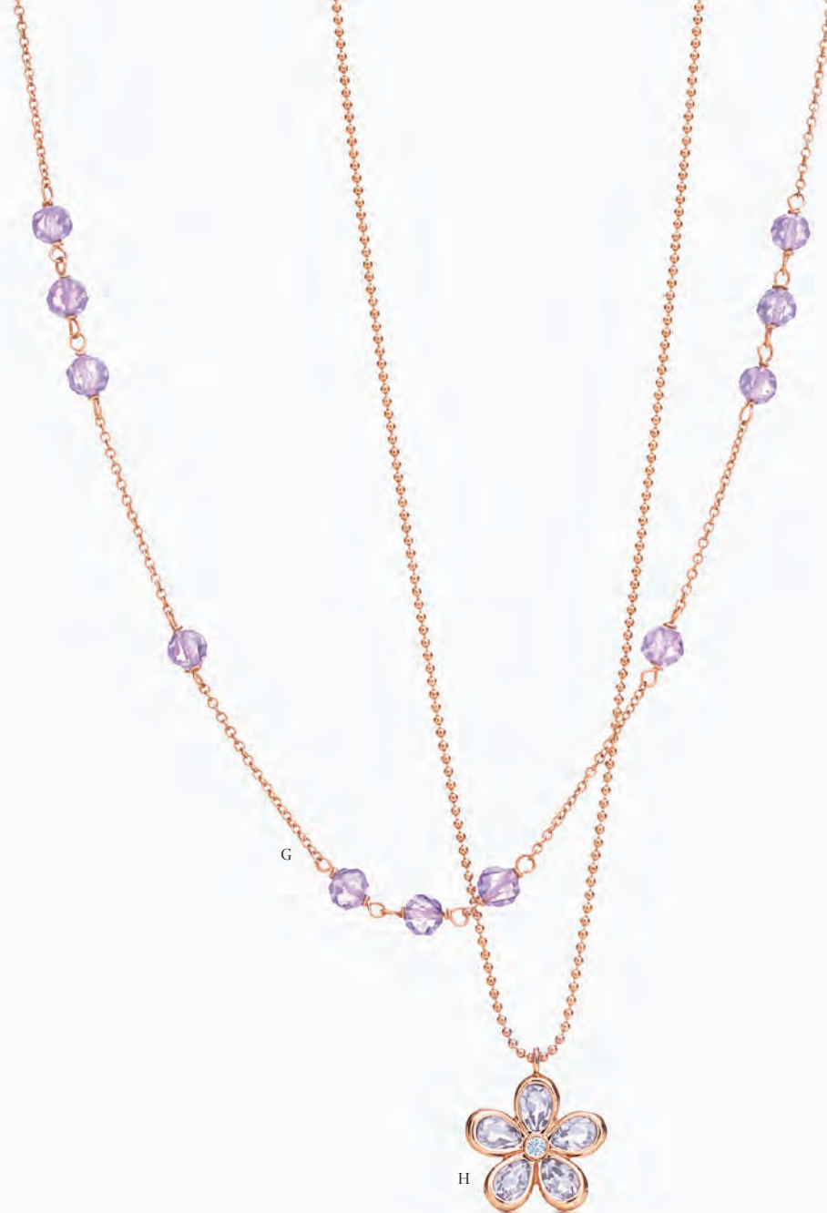
Tiffany Garden. G. Necklace in 18k rose gold with lavender amethyst beads. H. Flower pendant in 18k rose gold with lavender amethysts and a diamond, small.