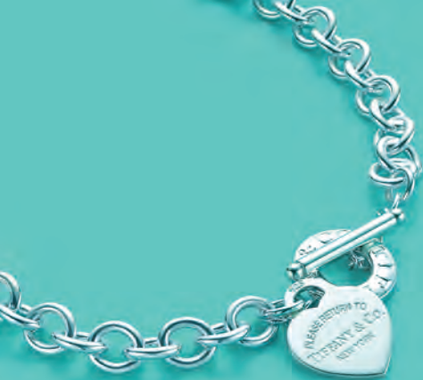
A. Return to Tiffany™ heart tag toggle necklace in sterling silver.