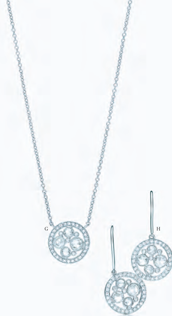
Tiffany Garden in platinum with diamonds. G. Round cobblestone pendant. H. Round cobblestone earrings, small, for pierced ears.