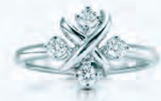
I. Jean Schlumberger Lynn ring in platinum with diamonds. Also in 18k gold.