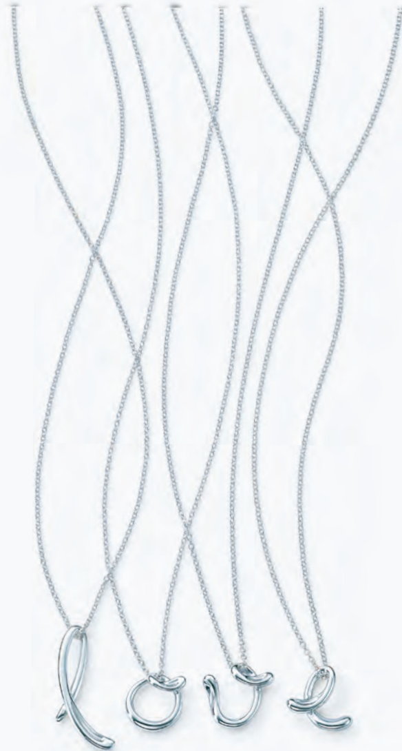
G. Elsa Peretti® Alphabet pendants in sterling silver, small. Also in 18k gold. All letters available. Original designs copyrighted by Elsa Peretti.