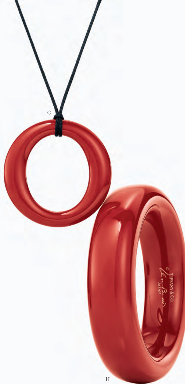
Elsa Peretti® designs in red lacquer over Japanese hardwood. G. Sevilla pendant, on a black silk cord. H. Bangle, small, medium or large. Additional colors available. Original designs copyrighted by Elsa Peretti.