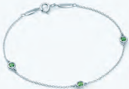
E. Elsa Peretti® Color by the Yard bracelet in sterling silver with three tsavorites.