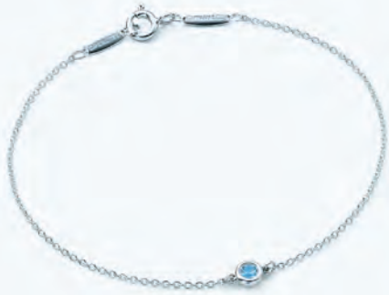
A. Elsa Peretti® Color by the Yard bracelet in sterling silver with an aquamarine.