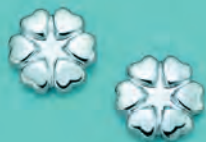
F. Paloma's Crown of Hearts earrings in sterling silver, for pierced ears. Also in 18k gold.