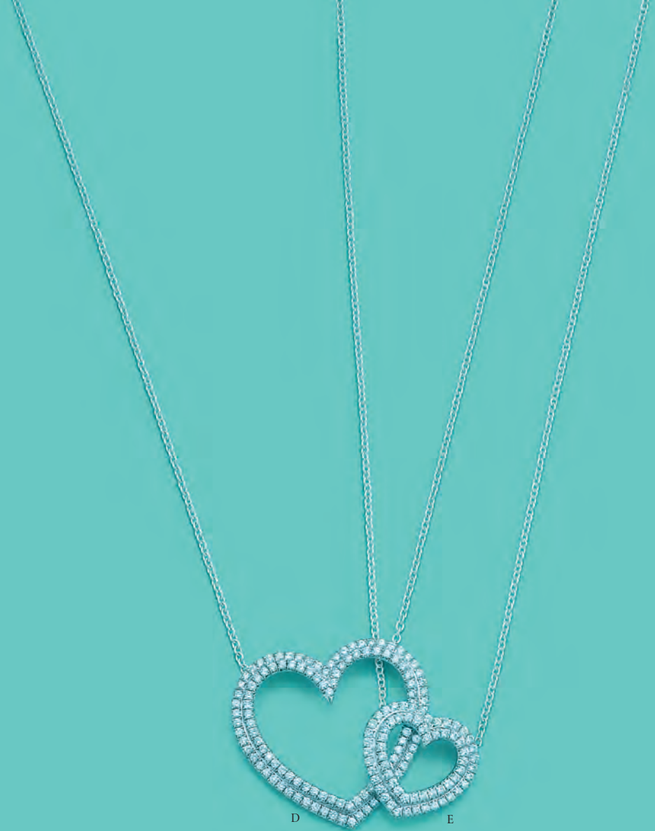
Tiffany Hearts™ double-row pendants in platinum with diamonds. D. Large. E. Small.