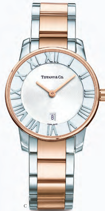
A. Tiffany Gemea® watch in stainless steel with Tiffany Blue numerals, white satin-finish strap, quartz movement, Swiss-made. B. Tiffany Gemea® watch in stainless steel with black numerals, black satin-finish strap, quartz movement, Swiss-made. C. Atlas® dome watch in stainless steel and 18k rose gold, quartz movement, Swiss-made.