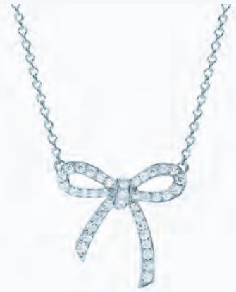
I. Bow pendant in platinum with diamonds.