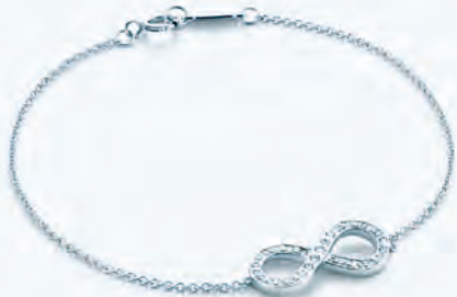
E. Tiffany Infinity bracelet in platinum with diamonds.