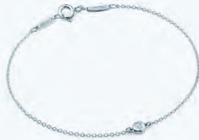
D. Elsa Peretti® Diamonds by the Yard® bracelet in sterling silver with a diamond.