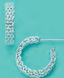
E. Tiffany Somerset™ narrow hoop earrings in sterling silver, small, for pierced ears.