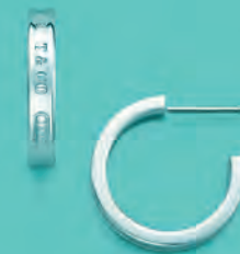
D. Tiffany 1837™ narrow hoop earrings in sterling silver, small, for pierced ears.