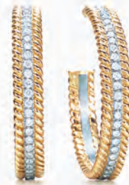
D. Jean Schlumberger Rope two-row hoop earrings in 18k gold and platinum with diamonds, medium, for pierced ears.

Jean Schlumberger rings in 18k gold and platinum with diamonds. A. Sixteen Stone. B. Rope two-row. C. Sixteen Stone with pink sapphires.