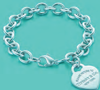
E. Return to Tiffany™ heart tag bracelet in sterling silver.