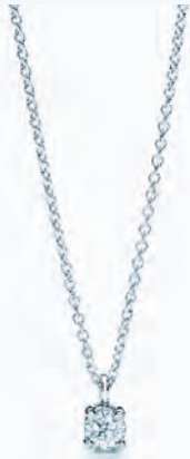
C. Tiffany diamond pendant in platinum.