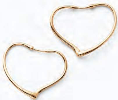
C. Elsa Peretti® Open Heart earrings in 18k gold, medium, for pierced ears. Also in sterling silver.