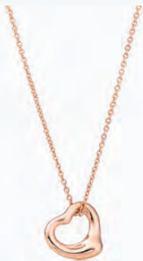
F. Elsa Peretti® Open Heart pendant in 18k rose or yellow gold.