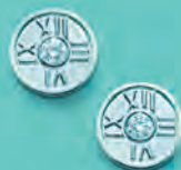
F. Atlas® earrings in 18k white gold with diamonds, for pierced ears.