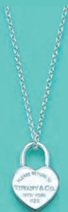
C. Return to Tiffany™ heart lock pendant in sterling silver, mini.