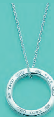
F. Tiffany 1837™ circle pendant in sterling silver, medium.