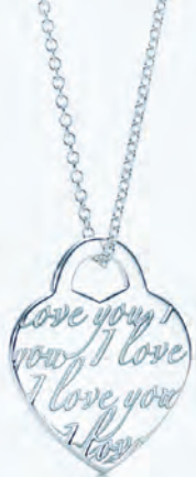
A. Tiffany Notes “I Love You” heart tag pendant in sterling silver, small.