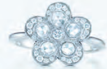
G. Tiffany Garden flower ring in platinum with diamonds.