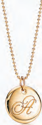
B. Tiffany Notes alphabet disc charm in 18k gold, small, all letters available. C. Small beaded chain in 18k gold, sold separately.