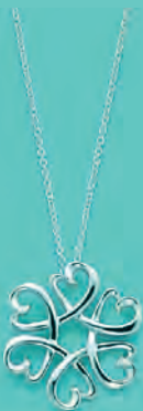
E. Paloma Picasso® Loving Heart medallion pendant in sterling silver, small. Also in 18k gold.