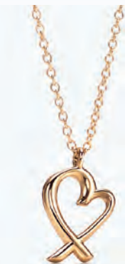
I. Paloma Picasso® Loving Heart pendant in 18k gold, small. Also in sterling silver.