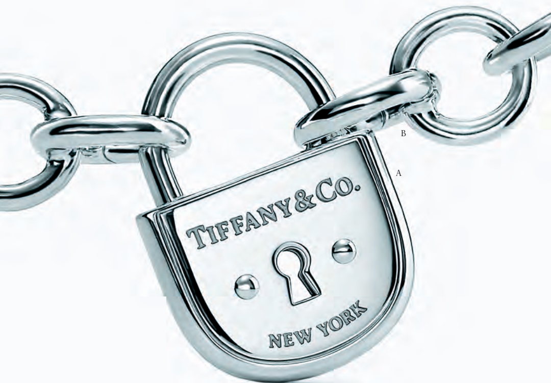
Tiffany Locks. A. Arc lock in sterling silver, medium. Lock opens and closes. B. Round link bracelet in sterling silver with two clasping ends. C. Heart lock in sterling silver, medium. Lock opens and closes. D. Oval link bracelet in sterling silver with two clasping ends. E. Arc lock in 18k gold, medium. Lock opens and closes. F. Round link bracelet in 18k gold with two clasping ends.