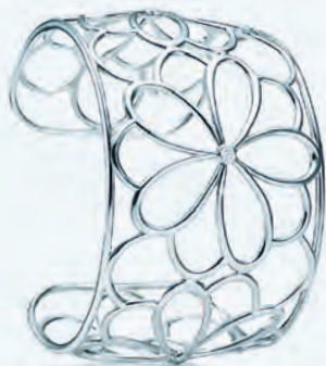
E. Tiffany Garden flower cuff in sterling silver with a diamond.