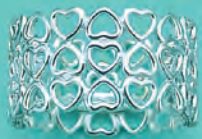
C. Paloma's Crown of Hearts three-row open ring in sterling silver.