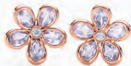
C. Tiffany Garden flower earrings in 18k rose gold with lavender amethysts and diamonds, small, for pierced ears.