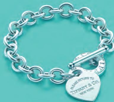
D. Return to Tiffany™ heart tag toggle bracelet in sterling silver.