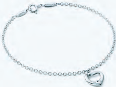
D. Elsa Peretti® Open Heart bracelet in sterling silver. Also in 18k gold.