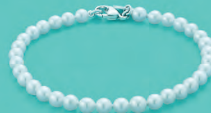
C. Tiffany cultured freshwater pearl bracelet with a sterling silver clasp, 4 1/2 to 5 mm pearls.