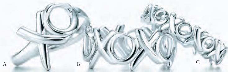
Paloma's Graffiti rings in sterling silver. A. Paloma Picasso® Love & Kisses. B. Love & Kisses, wide. C. Love & Kisses, narrow. Original designs copyrighted by Paloma Picasso.