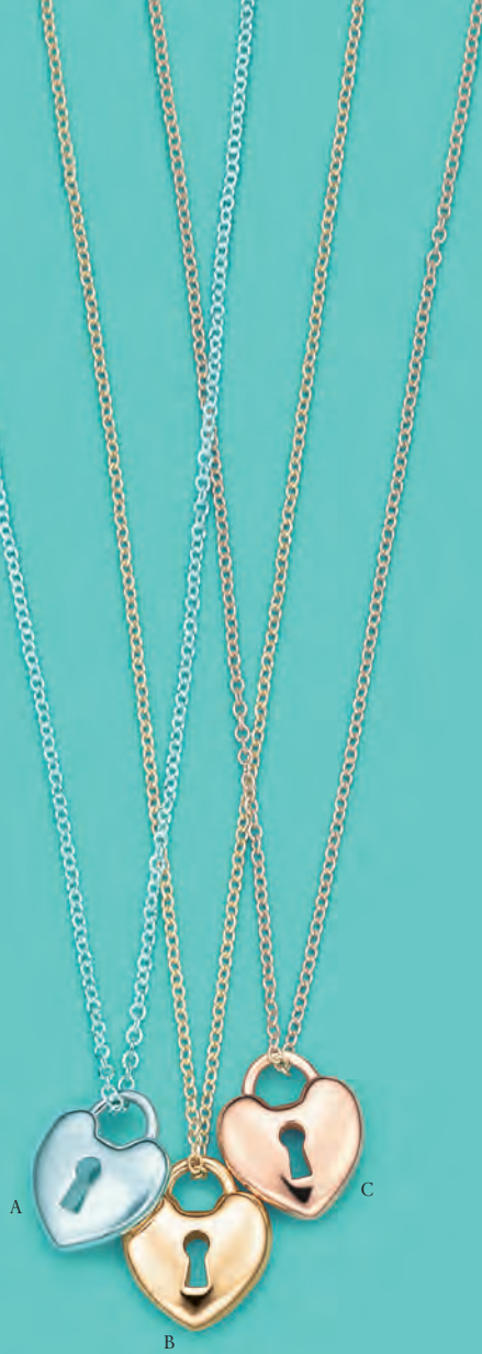
Tiffany Locks mini heart lock pendants. A. In sterling silver. B. In 18k yellow gold. C. In 18k rose gold.