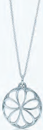
A. Tiffany Garden flower medallion pendant in sterling silver with a diamond, mini.