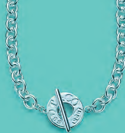
C. Tiffany 1837™ toggle necklace in sterling silver.