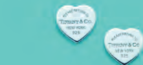
B. Return to Tiffany™ heart earrings in sterling silver, mini, for pierced ears.