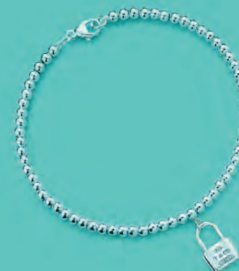
H. Tiffany 1837™ mini lock on a bead bracelet in sterling silver, 3 mm beads.