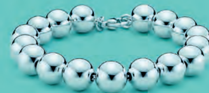
E. Tiffany Beads bracelet in sterling silver, 10 mm beads.