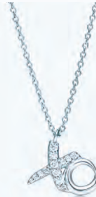
F. Paloma Picasso® Love & Kisses pendant in 18k white, rose or yellow gold with diamonds, mini.