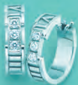
C. Atlas® hoop earrings in 18k white gold with diamonds, for pierced ears.