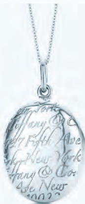
E. Tiffany Notes “727 Fifth Avenue” locket in sterling silver. F. Sterling silver chain, sold separately.