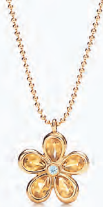
B. Tiffany Garden flower pendant in 18k gold with citrines and a diamond, small.