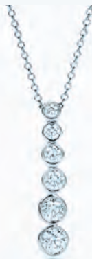
F. Tiffany Jazz™ graduated drop pendant in platinum with diamonds.