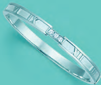
B. Atlas® bangle in 18k white gold with diamonds and a hinge, medium or large.