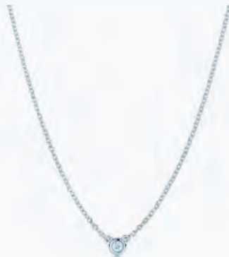
F. Elsa Peretti® Diamonds by the Yard® necklace in sterling silver with a diamond.