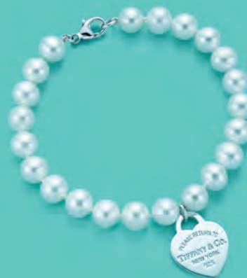
D. Return to Tiffany™ small heart tag in sterling silver on a cultured freshwater pearl bracelet, 7 to 8 mm pearls.