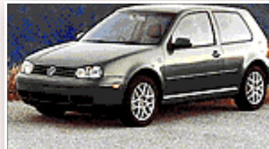
Seller photos - Click any to enlarge