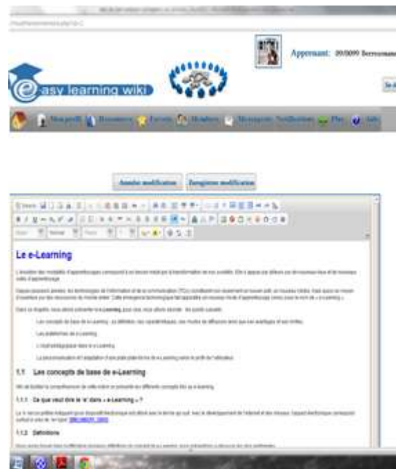
Figure 5. A newly created document using the online rich editor.

The member opens an existing document, upload an offline document, or event create a new one from scratch online using a rich editor (see figure 5).