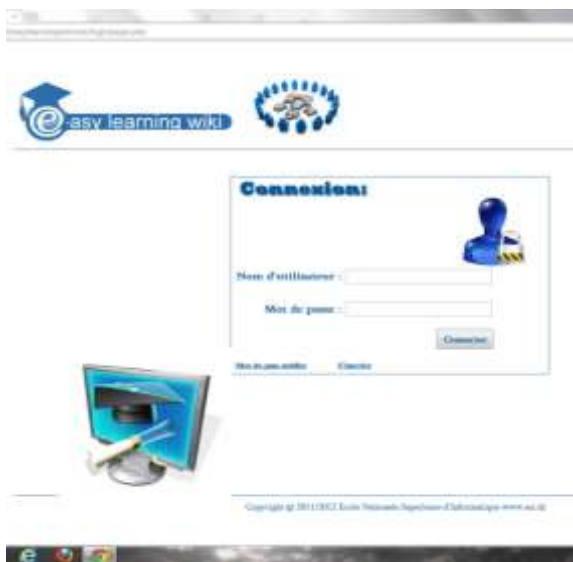
Figure 4. A screenshot of the EasyLearningWiki homepage.

The member (i.e. learner/teacher) has first to login to EasyLearningWiki (see figure 4).