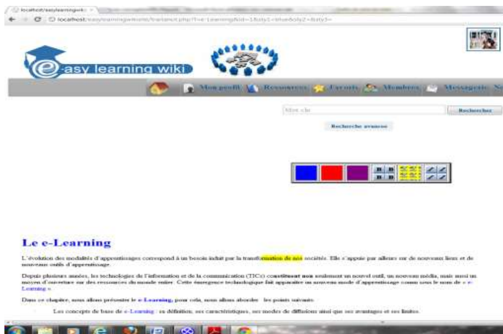
Example of a subjective annotation.

Every member can annotate the wiki documents in an objective manner (see figure 6) or a subjective one (see figure 7).