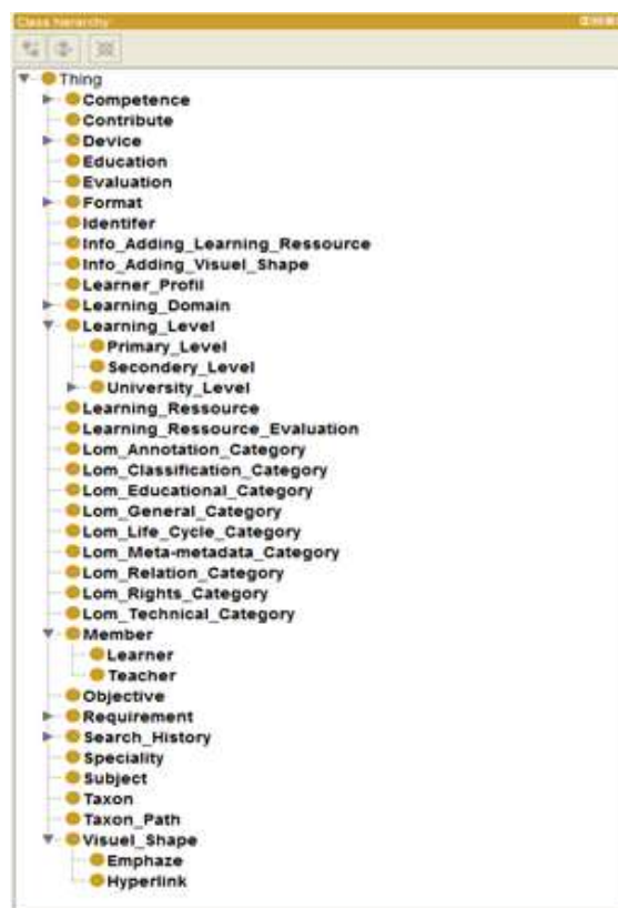
Figure 2. The ontology representation using Protégé editor

Figure 2 represents a screenshot of the ontology developed using Protégé. The figure illustrates the semantic annotation of learning resource and member's profile. To annotate a learning resource we use the Learning Object Metadata standard (LOM) [21] to ensure the interoperability between our wiki and other online learning systems (i.e. when importing a learning resource from another system). Furthermore, we propose other metadata such as the author, date and context of use (e.g. learning domain, learning level...). Furthermore, the member can use some visual forms in order to highlight the importance of some important information of the resource. However, in order to facilitate the capture and to encourage the members to be active and to share their knowledge resources, we chose to not require the capture of all metadata (i.e. some of them will be optional).