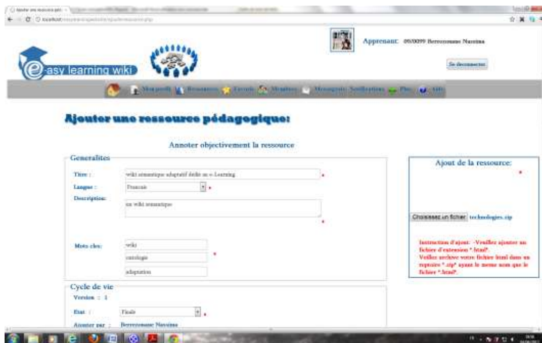
Figure 6. Describing a new added ressource (objective annotation).

Every member can annotate the wiki documents in an objective manner (see figure 6) or a subjective one (see figure 7).