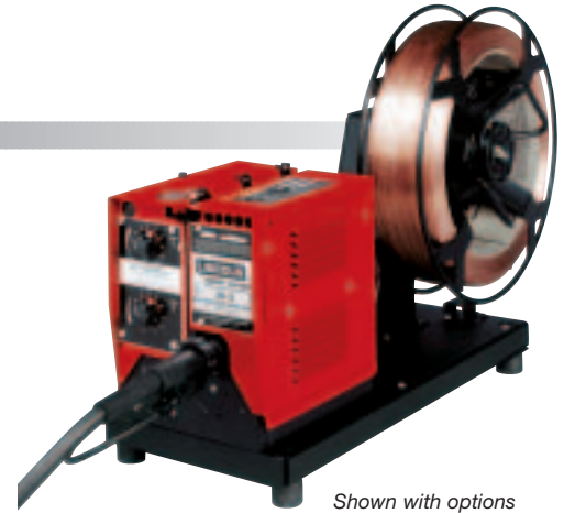
Shown with options

The LN-8 is a semiautomatic constant speed wire feeder providing dependable performance and reliable operation, making it ideal for shop or field operations. For precise wire feeding and quality welds, the LN-8 features controlled wire feed speed and voltage during starting for clean, positive starts and reduced stubbing, skipping and spatter. Solid state control compensates for wire drag and input line variations to maintain accurate wire feed speed. This wire feeder is easy to use with a quick release gun and cable connection for easy set up, and large wire feed and voltage control knobs that are easy to adjust with gloved hands.