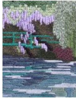
Monet's Water Lily Pond