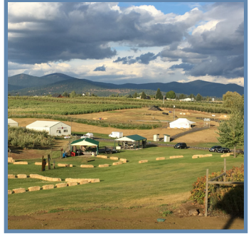
From the highlands of Green Bluff, a sweeping view of the mountains to the east. Community celebrations during the growing and harvest seasons draw tourists from throughout the region.