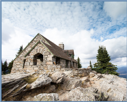
The Vista House at Mt. Spokane State Park.