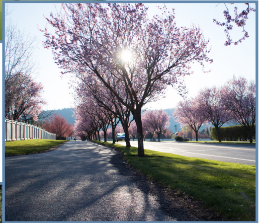
A tree-lined street in the city of Liberty Lake.