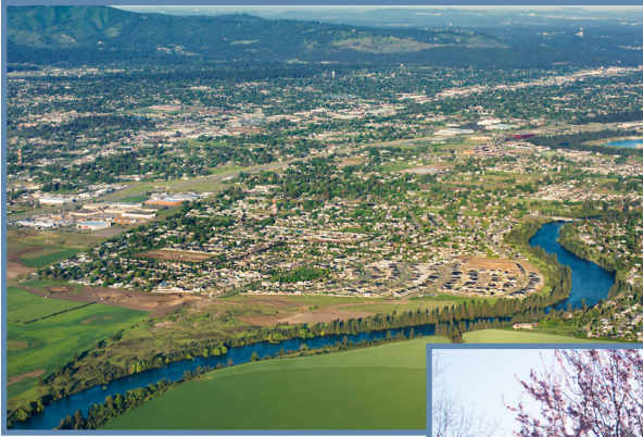
The Spokane River winds through the city of Spokane Valley.

The 4th Legislative District, encompassing the Spokane Valley, Mt. Spokane and surrounding areas, is home to more than 150,000 people. This is where we live and work—a fast-growing community with a thriving economy and outstanding recreational opportunities.