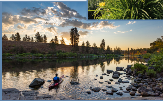
Kayaking on the Spokane River.