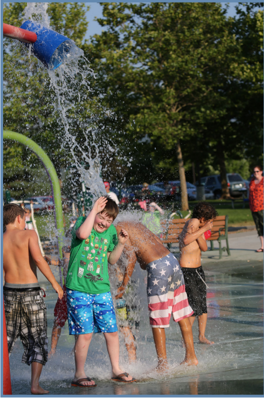
Fourth of July celebration in Liberty Lake.