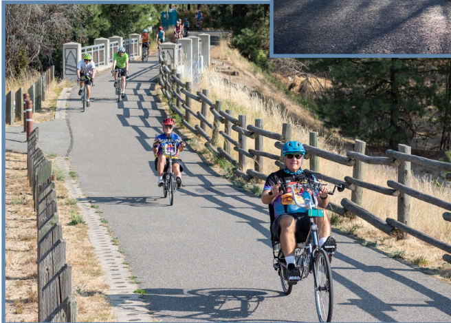
Cycling on the Centennial Trail in Spokane Valley.