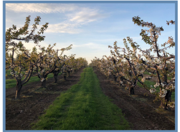
Apples, cherries and pears grow in Green Bluff orchards.