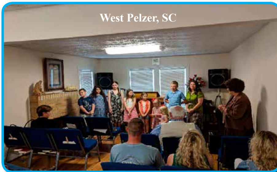
West Pelzer, SC