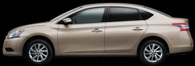
Brownish Gray (M) KAC