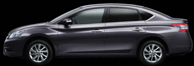
Dark Gray (M) KBD