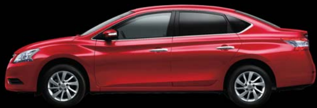
Red (M) NAH