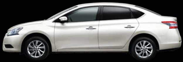
Pearl White (M) QX1