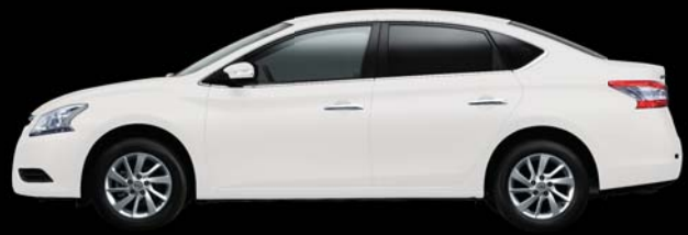
White (S) QM1