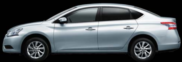
Silver (M) K23