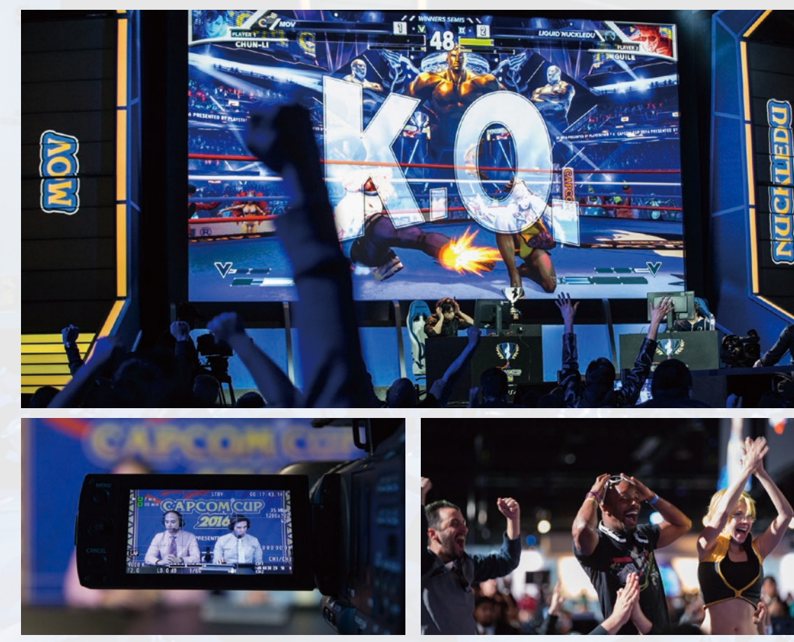
online video streaming