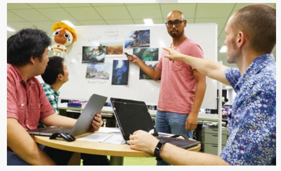
The team focused on localization for players around the world.