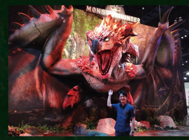
E3 2017, in Los Angeles. The official announcement and promotional video made a big splash at this event.

possible was a must. Because the slightest gesture or nuance can dramatically change your enjoyment of a game, we have in-house localization staff working side-by-side with the development team, assisting with the finer details and helping us move our development process forward. Also, we incorporated audio guidance into the game for the first time, so new users can easily grasp how to play while concentrating on the game itself. While this work does take time, we balanced our schedule accordingly and kept recordings on track.