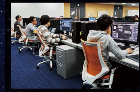
Creators on the project endeavoring to deliver the high quality expected of a collaboration between Marvel and Capcom.