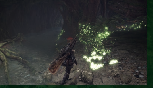
Experience an extreme world of hunting as you explore this living, To ensure players don't get lost in this world (which is two to two-and-a-half times larger than before), scout flies guide hunters to the monsters they are tracking.