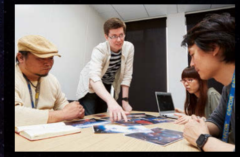
As a global title, focus was put on optimal localization and understanding the needs of each region.

©2017 MARVEL ©MOTO KIKAKU. ©CAPCOM CO., LTD. 2017, ©CAPCOM U.S.A., INC. 2017 ALL RIGHTS RESERVED.