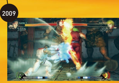
Street Fighter IV The third best-selling title in the series gained popularity thanks in part to its advanced 3D graphics.

The next numbered title in the series following Street Fighter II. In addition to a major revamp to the roster. Alex inherited the role of main character from Rvu.