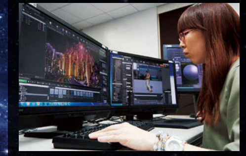
Gorgeous CG graphics support the Cinematic Story Mode, a series first that provides players with an engaging story experience.

In MARVEL VS. CAPCOM: INFINITE, the word "infinite" in the title has a specific meaning. Not only is this in reference to Marvel's all-important "Infinity Stones," it is also meant to make the game more approachable for Marvel fans by consciously not attaching a number to the title. This allows us to invite Marvel fans to the Capcom world, effectively leveraging this series to energize the market.