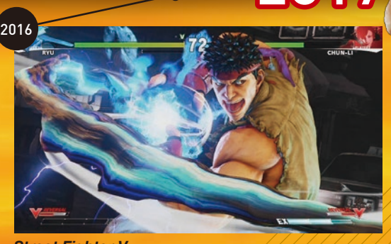
Street Fighter V Featured gameplay that enabled both experienced players and newcomers alike to play together: based around a development concept of "reboot."