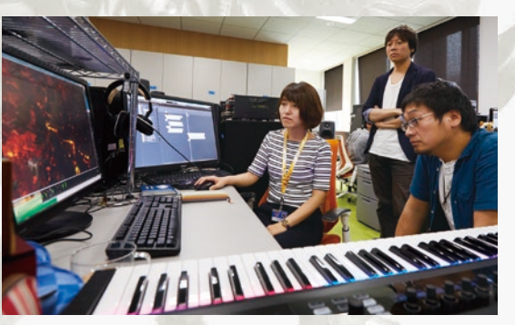
Music, visuals and sounds were woven together and meticulously scrutinized to create the very best Monster Hunter experience.