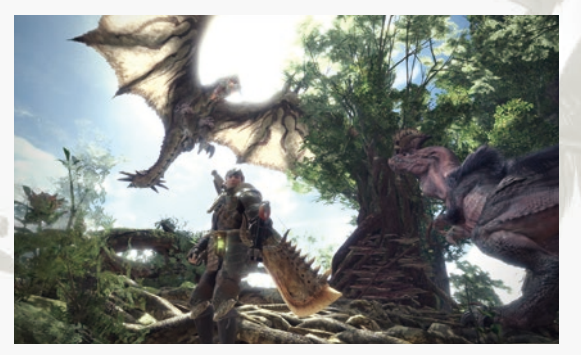
Expressing the movement, filtering and reflection of light brought the Ancient Forest to life.

Tokuda: We have the core of Monster Hunter , where you hunt in a living, breathing ecosystem, made all the more impressive on the big screen. We hope players enjoy! Tsujimoto: It has all the excitement of the series, with even more freedom to hunt! As the name implies, we want to bring the "world" of Monster Hunter to everyone around the world. We hope everyone is looking forward to it!