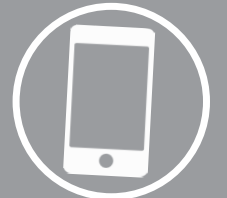
SOCIAL MEDIA PROMOTION