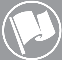
NAMING RIGHT BENEFITS