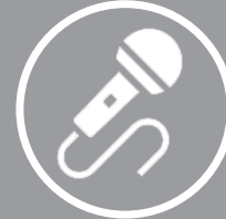
5-MIN EVENT PRESENTATION