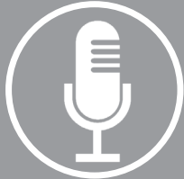
PROMOTIONS ON PODCAST