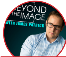
TOP CHARTING PODCAST