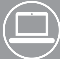
LOGO/LINK ON FITPOSIMUM.COM