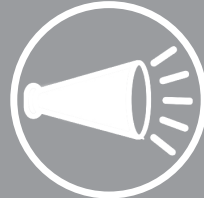
MAX VISIBILITY & EXPOSURE