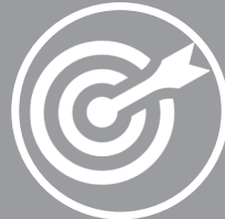
HIGHLY TARGETED VISIBILITY