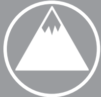
TITLE SPONSOR BENEFITS