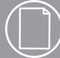
ATTENDEE BOOK ADVERTISEMENT