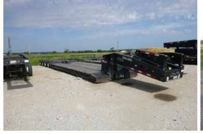
1 of 2 – 2013 Trail King TK120HED-624 60 Ton