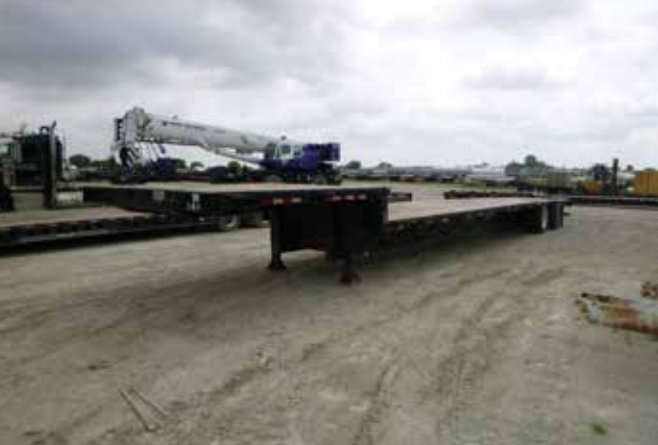
1 of 3 – Great Dane 53 Ft x 102 In.