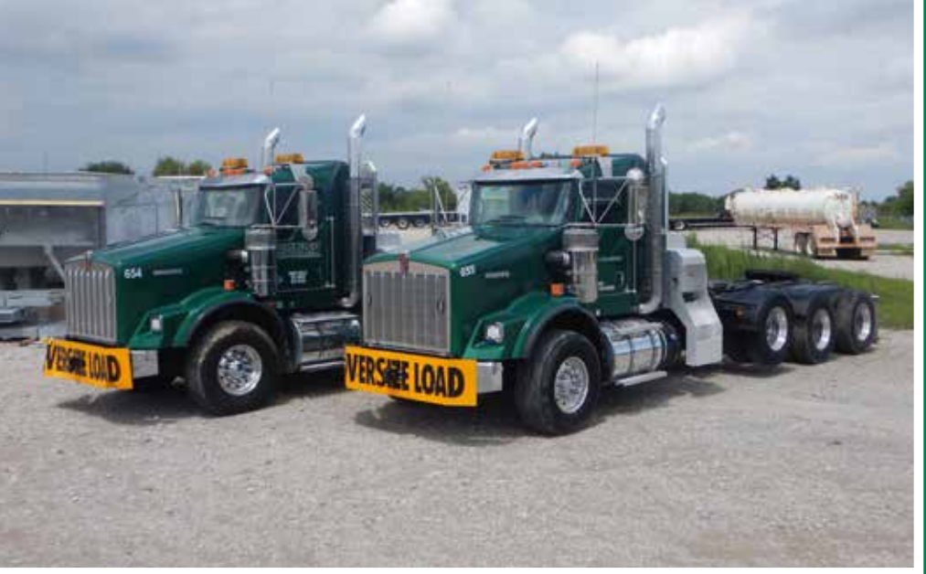
2 of 5 – 2019 Kenworth T800 Wide Nose