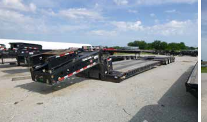
1 of 2 - 2013 Trail King TK120HED-624 60 Ton