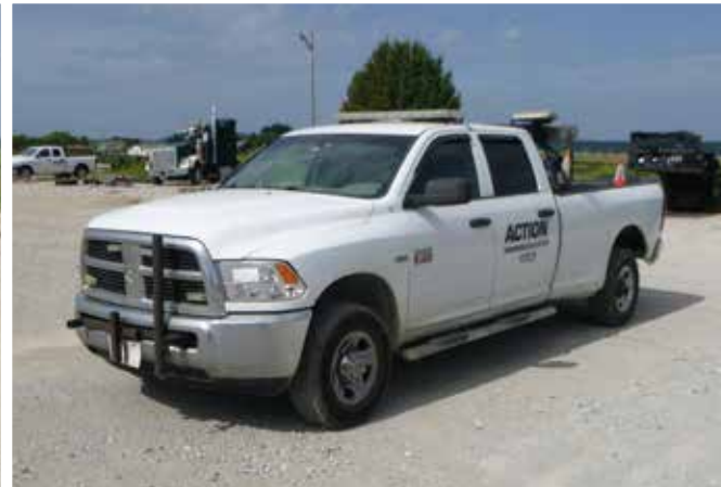
1 of 2 - 2012 Ram 2500 Crew Cab 4x4