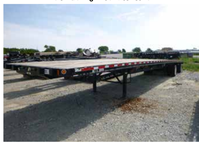
1 of 6 – 2014 Fontaine 53 Ft x 102 In.