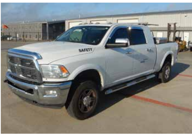
2012 Ram 3500 Crew Cab 4x4