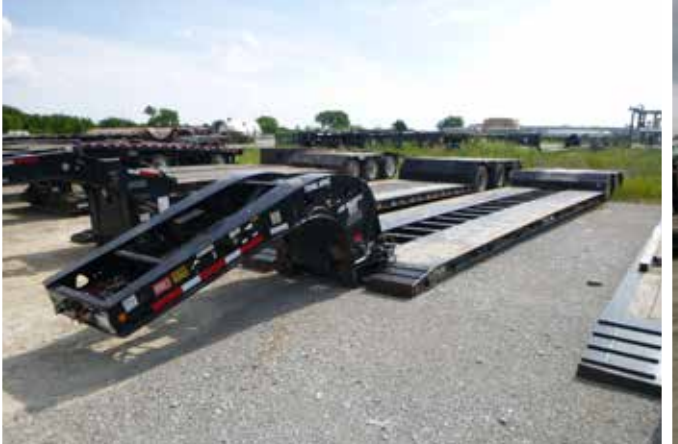
2013 Trail King TK150HG-532 35 Ton