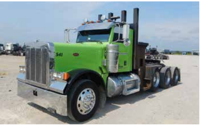
Peterbilt 379 Winch