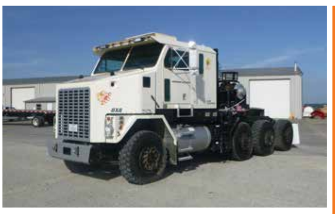
Oshkosh M1070 8x8x4 Winch