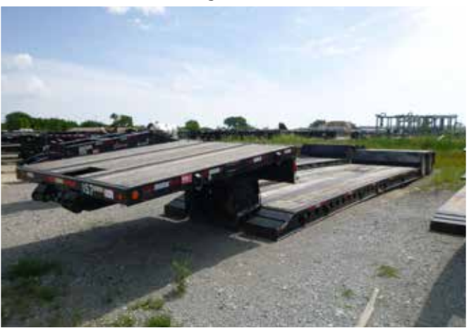
1 of 2 – Aspen MT35-2