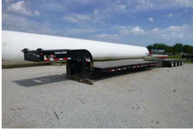
1 of 2 – 2013 Trail King TK120ES-584 60 Ton Oilfield