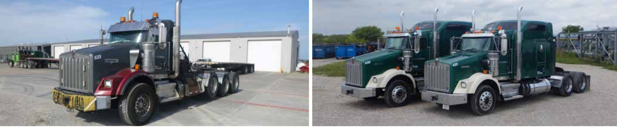
1 of 2 – 2012 Kenworth T800