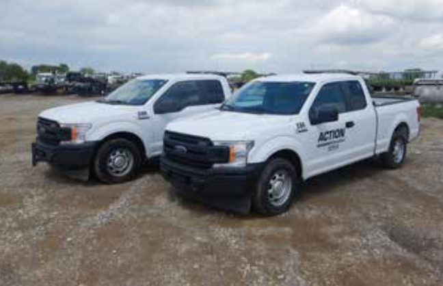
2 of 3 – 2019 Ford F-150