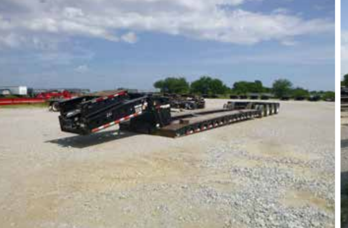
Trail King TK140HDG-553 70 Ton