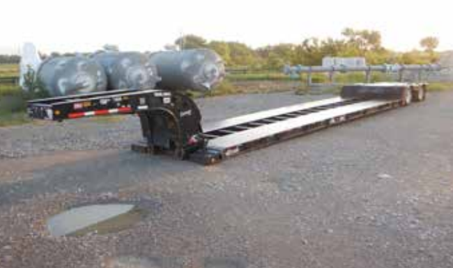
1 of 5 – 2013 Trail King TK50HG-532 35 Ton