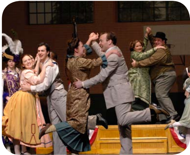
WCU students performed "The Music Man" in front of sold-out audiences.