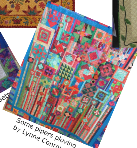
Some pipers plovig by Lynne Conroy