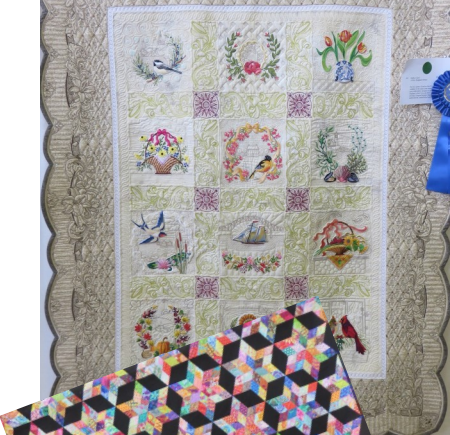
Starry Night by Elaine Dwyer