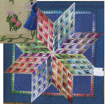
Kaboom by Tere D'Amato