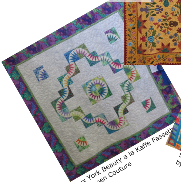
New York Beauty a la Kaffe Fassett by Noreen Couture