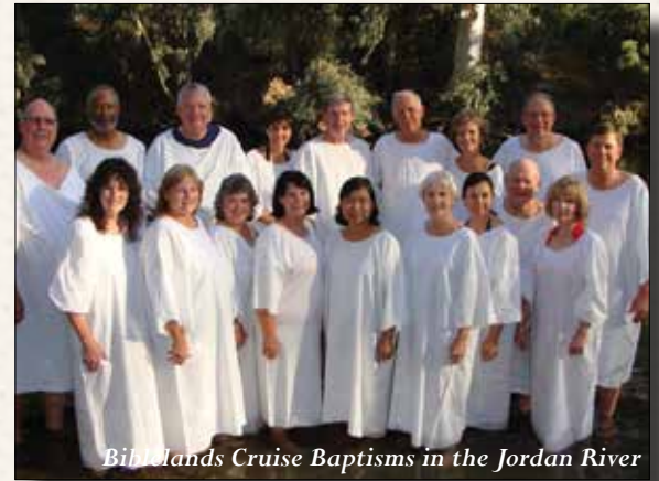
Biblelands Cruise Baptisms in the Jordan River

We've designed a fantastic itinerary on a remarkable 16-day trip that includes 12 fabulous cruise days. You'll experience up-close the forever-impacting Mediterranean ports of Athens (optional Corinth) , Jerusalem (two days), Galilee , Rome , Malta and Rhodes . Plus the knock-your-socks-off islands of Crete , Mykonos and Cyprus ! Combine all those sites with stellar at-sea Bible studies and there's not a better Holyland itinerary on any ship!!