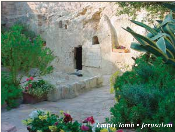
Empty Tomb • Jerusalem