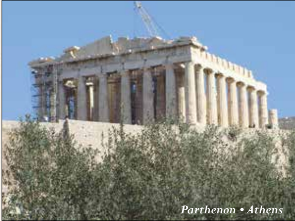
Parthenon • Athens

Join us for a 16-day trip of a lifetime!