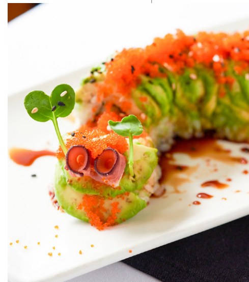
Sansei Steak & Sushi Bar