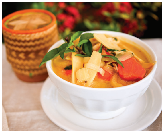
Charley's Thai Cuisine