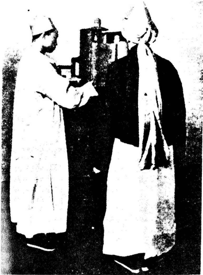
CHINESE JEWS AT THE CEREMONY OF READING THE TORAH