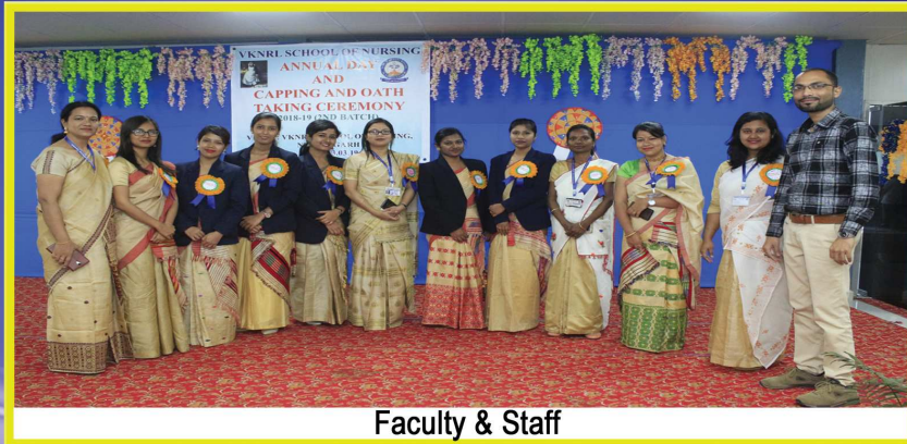
Faculty & Staff