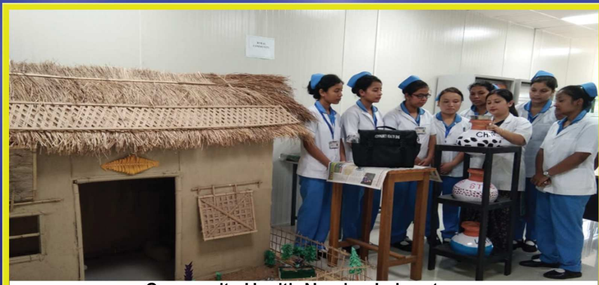
Community Health Nursing Laboratory