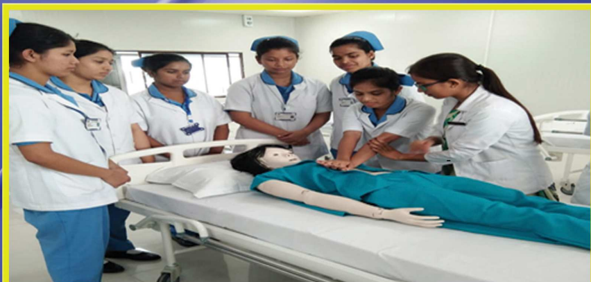
Advance Practice Laboratory