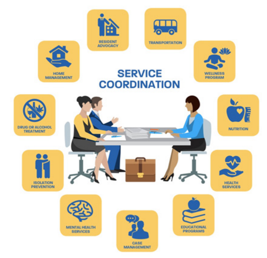
Exhibit 2: Holistic Assistance Coordinated by Multifamily Service Coordinators

Core functions that all service coordinators should fulfill include: