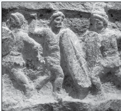
Sarcophagus with combat scene of Etruscan soldiers.

The following excerpt is from the article, “The Heavenly Host” (Fall 1999), which relates to this session and can be purchased at www.lifeway.com/biblicalillustrator .