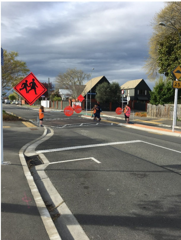
Image 1: Speed management treatment using a raised platform with kea crossing, and road narrowing.

Below is an example of a possible infrastructure treatment to help encourage motorists to comply with lower speed limits around schools on roads.