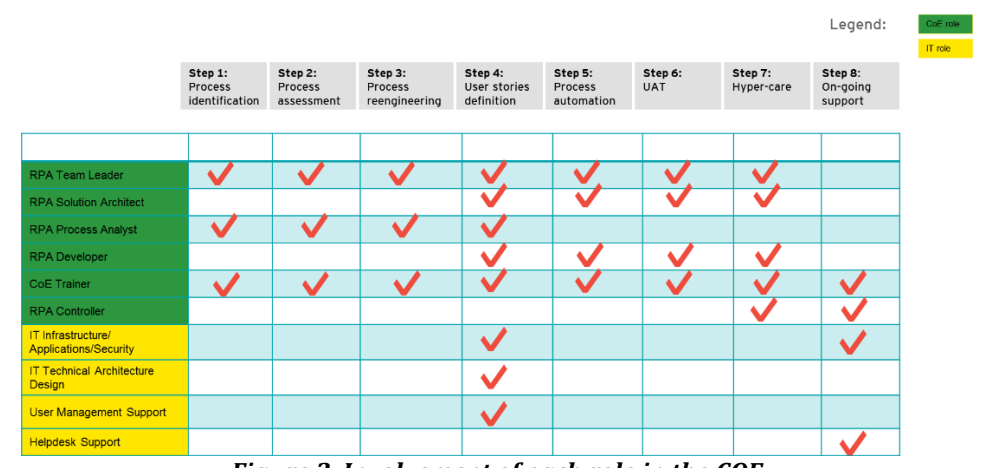
Figure 2. Involvement of each role in the COE

The new created organization will have a team with a mixed of skills involved in the newly created CoE. In order to understand the complexity of their involvement, in Figure 2, I highlighted each role.