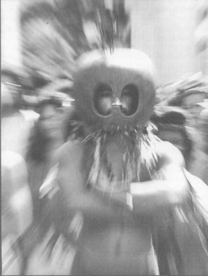
At the federal trials of Hawaiian "trespassers" on Kaho'olawe Island, Hawaiians used symbols of our Native past to illustrate opposition to American colonization. The gourd helmet took on a new meaning in this context as a sign of resistance and pride.